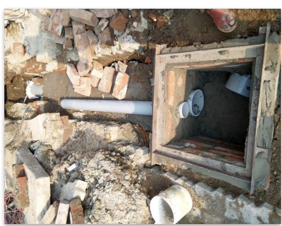
Septic Tank of a Household