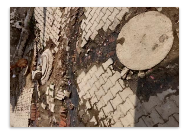
Open drain ending at open ground