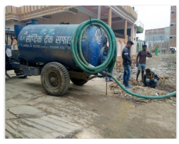
Vacuum Tanker involved in emptying process