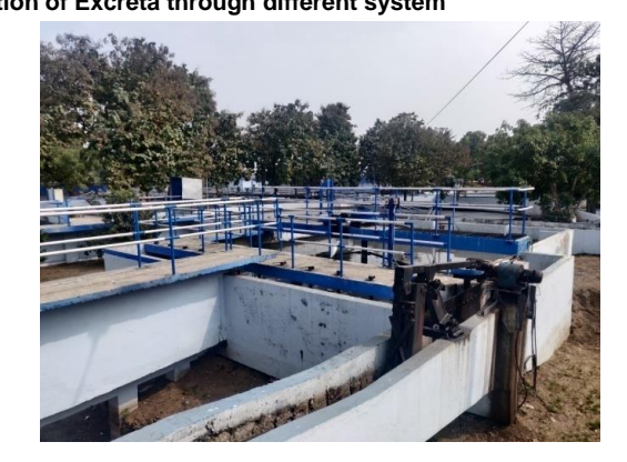
Figure 5: Sewage Treatment Plant of Prayagraj at Naini