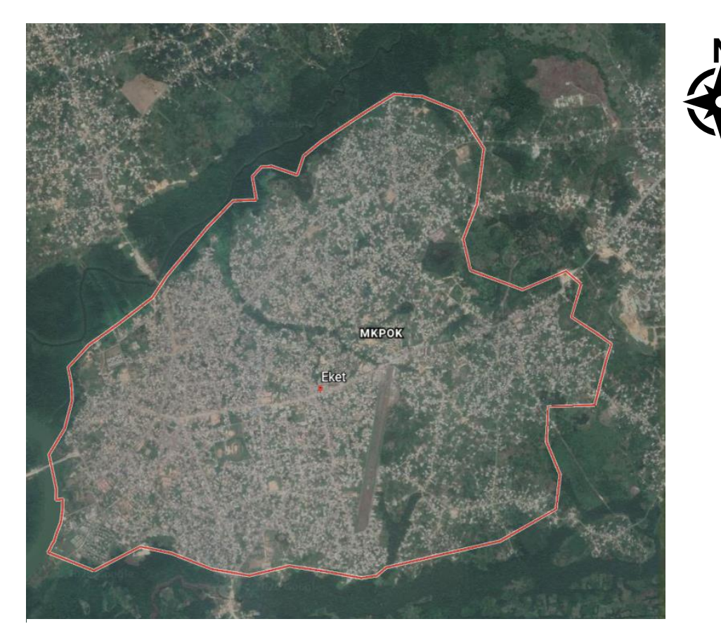
Figure 1: Map of Eket Municipality (Google Maps)

Eket is a city in Akwa Ibom state in the southern region of Nigeria. It is one of the thirty three (33) local government administrative areas (LGA) in the state, located between latitude 4°33" to 4°45" and longitude 7°52" and 8°02". The city is bordered by Nsit Ubiom LGA to the north, Ibeno LGA to the south, Onna LGA in west and Esit Eket in the east, and is the second largest city in the state, covering a land mass of 214 km<sup>2</sup> (Figure 1).