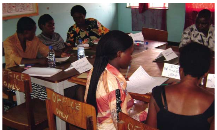
Professional training of kiosk operators, Zambia