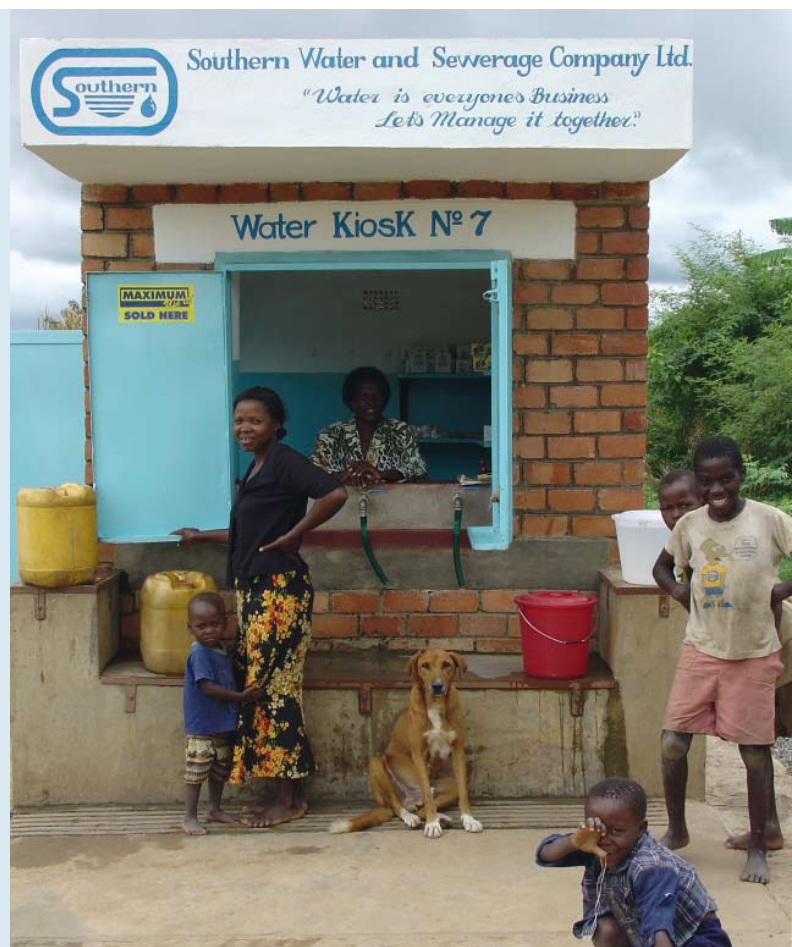
Photo: Water kiosk in Zambia

German Development Cooperation (GDC) is supporting water sector reform processes in many countries in Sub-Saharan Africa. The approach taken typically includes the decentralisation and commercialisation of water supply and sanitation (WSS) services, taking into account the needs of the poor in particular. One example of best practice implementation is the case of Zambia. Now, with the support of German Development Cooperation, the successful concept of water kiosks is being adapted and transferred to other countries in Sub-Saharan Africa. The multiplication of the concept goes hand in hand with professional partnerships and the exchange of experiences between development partners in the different countries. Kenya is adapting the concept and setting up a large number of kiosks while a pilot project is currently running in Tanzania.