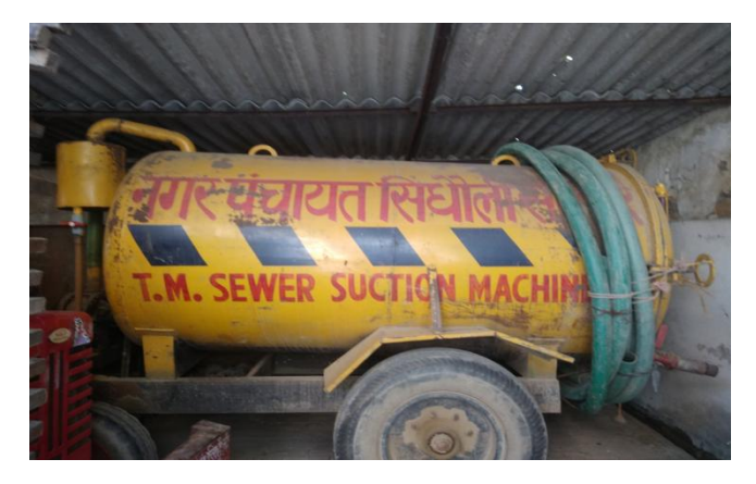
Figure 5: ULB owned vacuum tanker.

The frequency of emptying varies from 15 to 20 years or more as the majority of the containment systems in the city are LTs with impermeable walls connected to open drain. It was observed that households that are taking too long to get their containments emptied are rather using their systems without emptying and hence, it was assumed that the population using their systems with emptying (variable F3) is taken as 50% for all sanitation systems.