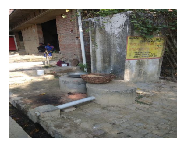
Figure 2: Two chambered circular septic tank.

Containment: Based on sample household survey, KIIs and FGDs with relevant stakeholders, it is observed that 100% of the population is dependent on the On-site Sanitation Systems (OSS). The most prevalent OSS in Sidhauli are fully lined tanks (FLT) connected to open drains (T1A3C6, 60%) and septic tanks connected to open drains (T1A2C6, 30%) and lined tanks with impermeable walls and open bottom with no outlet and no overflow (T1A4C6, 10%). Figure 2 and Figure 3 show examples of septic tanks. According to the Executive Officer and Junior Engineer, SNP Individual Household Latrines (IHHL) have been provided to 896 households having no toilets or access to community toilets in the vicinity or to households with insanitary toilets as of October 2020, under Swachh Bharat Mission (SBM-Urban).