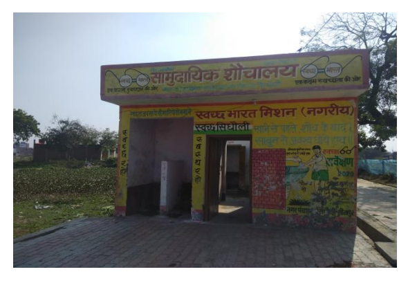
Figure 4: Community toilet constructed under SBM (U).

Community Toilets/Public Toilets: There are 7 community toilets and 2 public toilets in Sidhauli which have Septic Tanks connected to Open Drain (STOD)<sup>6</sup> as their containment system. The average size of FLT in community toilets is 12 x 6 x 8 m (Figure 4). The average size of FLT (septic tanks) in public toilets is 6 x 3 x 6 m. The majority of the CT/PTs have been recently constructed under SBM and hence have not yet reached at stage where emptying is required, which would be further stretched due to low number of people actually using these facilities and every household in the city having its own functional toilet.