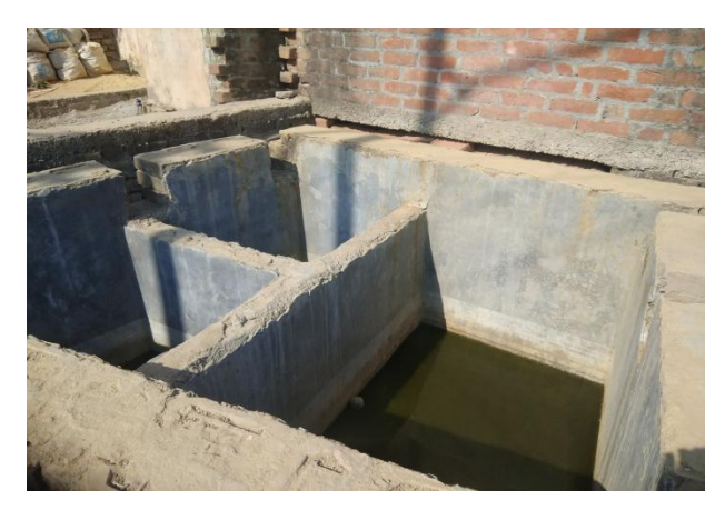
Figure 3: Septic tank under construction.

Community Toilets/Public Toilets: There are 7 community toilets and 2 public toilets in Sidhauli which have Septic Tanks connected to Open Drain (STOD)<sup>6</sup> as their containment system. The average size of FLT in community toilets is 12 x 6 x 8 m (Figure 4). The average size of FLT (septic tanks) in public toilets is 6 x 3 x 6 m. The majority of the CT/PTs have been recently constructed under SBM and hence have not yet reached at stage where emptying is required, which would be further stretched due to low number of people actually using these facilities and every household in the city having its own functional toilet.