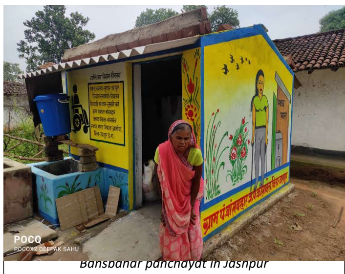
Bansbahar panchayat in Jashpur