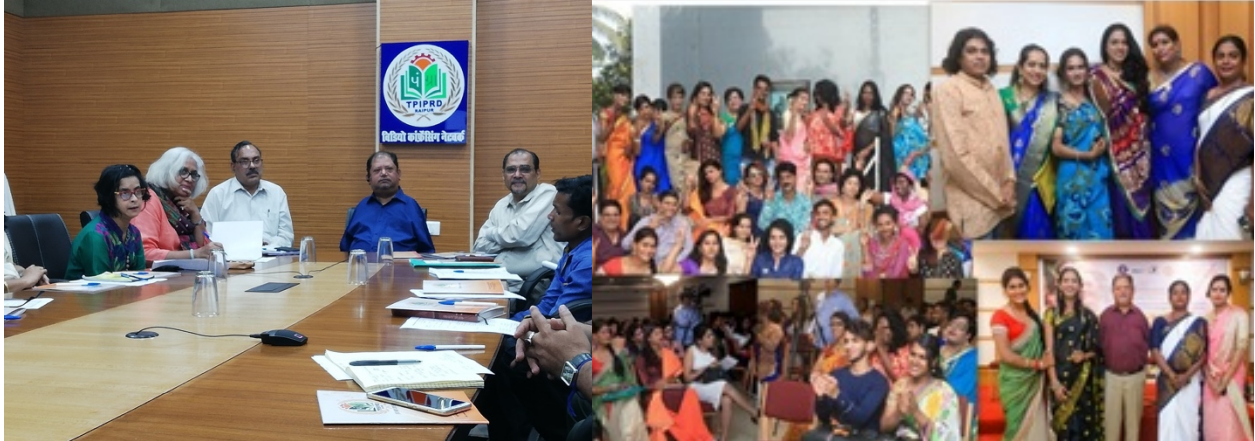
Image 5 and 6: Interface workshop, September 2018 (left), Collage of the consultative meeting with transgender persons (right)

Chhattisgarh, with 61 points, has been declared as a top performing state in India on the gender quality parameters of the Sustainable Development Goals (SDGs) as per NITI Aayog's SDG India Index report 2020-2021. There is significant improvement in the parameters from last year in which Chhattisgarh had scored 43 points and was ranked seventh in the country. Inclusive policy and programme initiatives such as the inclusive sanitation pilot are great steps to help Chhattisgarh sustain its position in the gender equality parameters and inspire more such efforts in the sector.