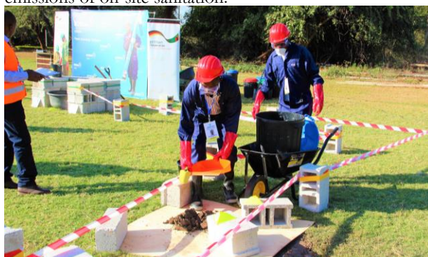
Pit Emptiers during a Skill's Challenge in Zambia.

In 2008, the programme co-founded the Sustainable Sanitation Alliance (SuSanA) – an international network for sustainable sanitation practitioners, whose secretariat is hosted by the programme. SuSanA has grown to over 11,000