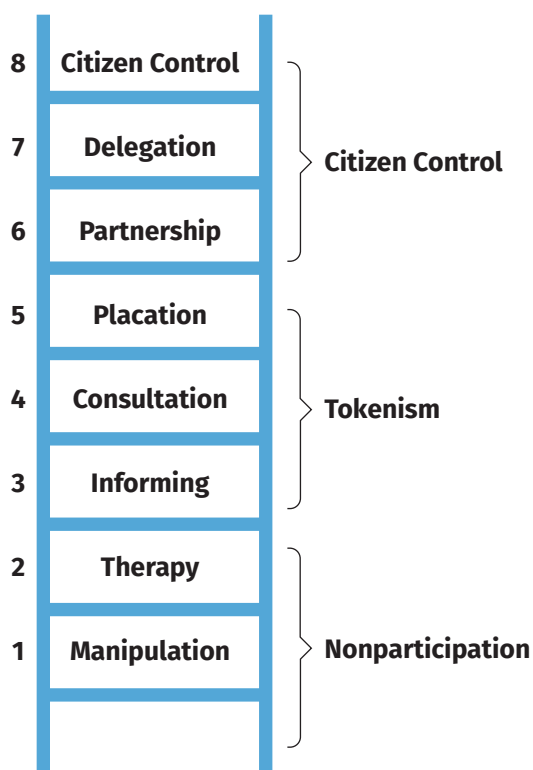
Figure 2 Arnstein's Ladder (1909) Degrees of Citizen Participation