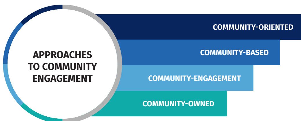
Figure 3 Approaches to community engagement

Each approach is distinct and one is not of a higher order than the other. In selecting an approach, the desired outcome should be the primary consideration. For example, in a measles outbreak, a community-oriented approach is perhaps most appropriate as the objective would be to mobilize parents to have their children vaccinated. On the other hand, in the event of a drought that requires changing of types of crops, a community-owned cooperative for seeds would be more appropriate.