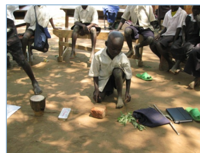
FIGURE 1: RANKING CAN PROVIDE A MEANS OF YOUNG CHILDREN ACTIVELY PARTICIPATING & EXPRESSING THEIR VIEWS

At each step of the process, responses are recorded. This includes recording all of the responses free-listed in the 'pile' section, as well as the final 'rank' of each agreed afterwards. Crucially, however, the note-taker records the reasons stated any participant – their 'account' for the positioning of any object. These accounts – generally expressed as clear, propositional statements – often provide a rich insight into local circumstances, attitudes and challenges.