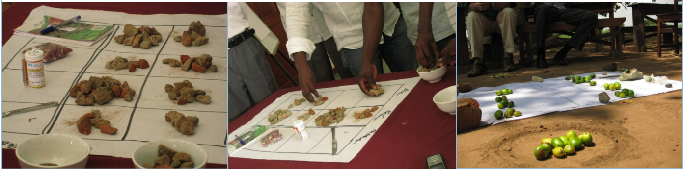
FIGURE 4: LOCALLY AVIALABLE MATERIALS, SUCH AS ROCKS OR LEMONS, CAN BE USED BY PARTICIPANTS TO 'VOTE' ON THE IMPORTANCE OF ISSUES IDENTIFIED IN THE EARLIER LISTING ('PILE') PHASE. TEMPORALITY CAN ALSO BE INTRODUCED INTO THIS EXERCISE, AS SHOWN IN THE PHOTOS AT LEFT & CENTER, WHICH SHOW THE IMPORTANCE GIVEN TO CERTAIN 'PROBLEMS' BOTH 'BEFORE' AND 'NOW'.