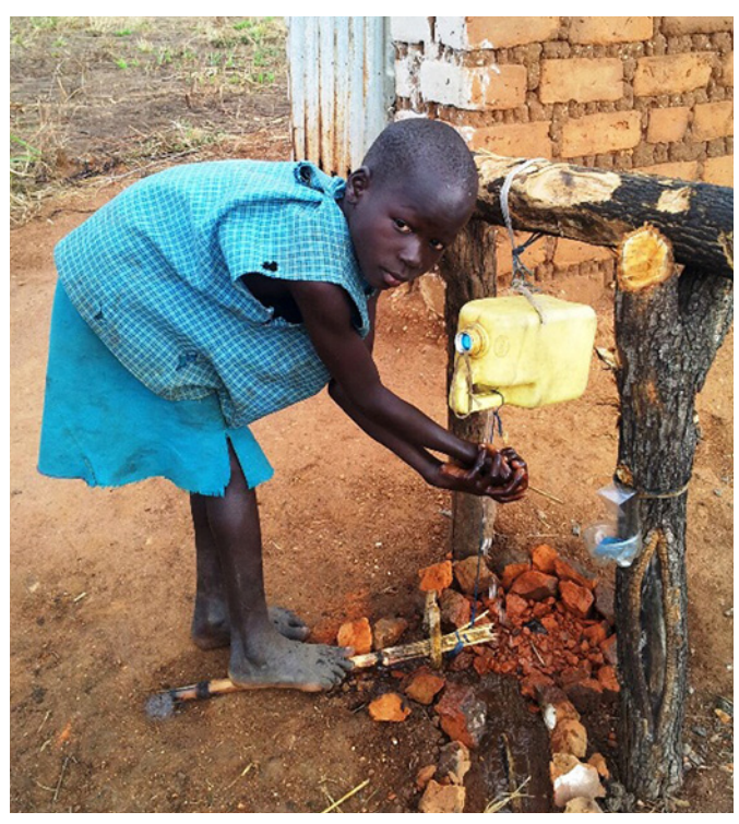
Child demonstrates handwashing in CLTS village in South Sudan

In South Sudan, the programme has slowed down due to the escalation of fighting, but where and when the level of conflict is low, implementation of CLTS continues, with 100 villages targeted in 2015. More flexible and less cumbersome procedures for verification are being developed.