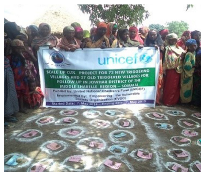
Mapping during triggering in Middle Shebele, Somalia

good. The programme will then gradually move to difficult-to-reach areas with more Al Shabab control in the rest of South-Central Somalia.