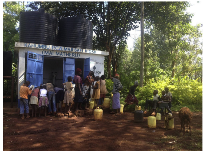
Fig. 2. People queuing at one of the study kiosks.

The present article, as it investigated the regularity of kiosk use, focused on a subsample of the larger research project (Contzen, 2018), namely on households reporting to use the kiosks at least during one of the seasons. That is, we excluded households who did not report using the kiosks at any time of the year ( n = 225 ). The remaining sample size was 205 households (47% of the total sample). To assess the statistical power of the planned path analysis a post-hoc power analysis with G*Power 3.1.9.2 was conducted, using the "Linear multiple regression: Fixed model, R^2