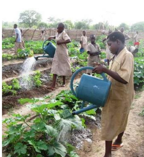
Figure 2: Students working in the school garden