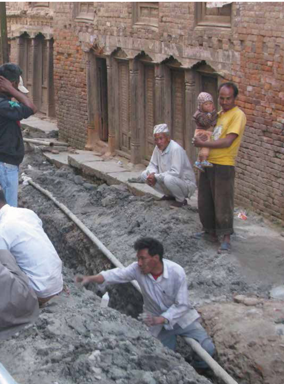
Simplified sewers are being installed in Nala, Nepal. Photo credit: CIUD

Source: Manila Principles on CWIS. Source: (Narayan and Lüthi 2019)