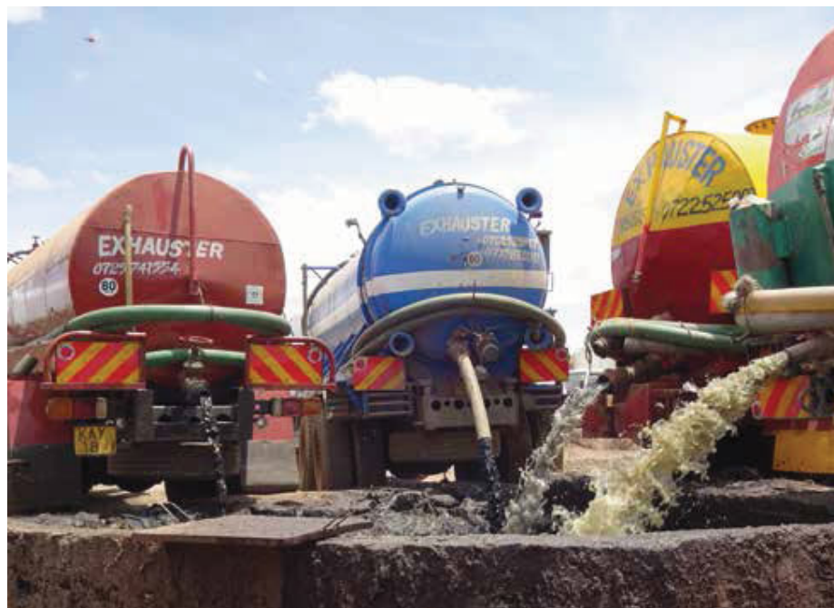
Trucks empty fecal sludge into sludge-drying beds in Nairobi, Kenya.

Further Reading: https://tinyurl.com/y89fbxr4