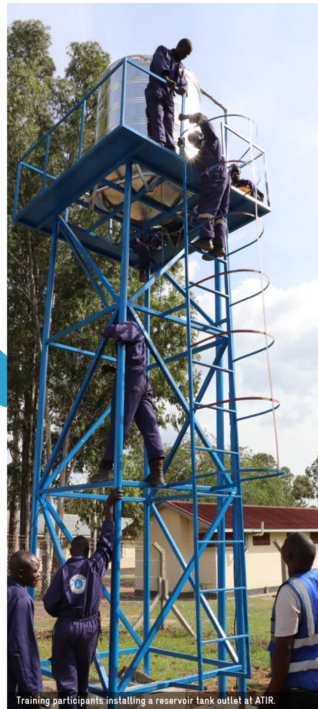
Training participants installing a reservoir tank outlet at ATIR.

Through practical skills acquisition, the technicians in the training programme will be equipped with the necessary skills to take on operation and maintenance assignments for piped water systems on behalf of the NUWS as well as district local governments in their locality. This contributes to the overall WatSSUP programme objective towards sustainable water and sanitation service delivery in refugee settlements and host communities.