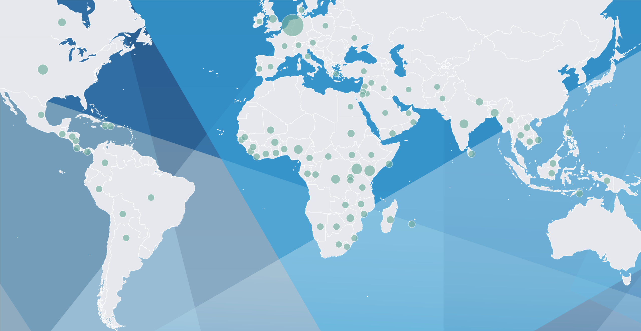
Location of WASH Systems Academy users, February 2022