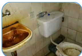
Limited or lack of skills amongst staff within the institutions to do repairs