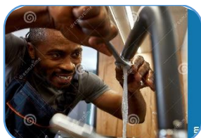
Lack of easily accessible technicians to do routine repairs to the infrastructure at the institutions