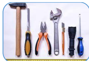
Low access to tools and equipment to do the repairs