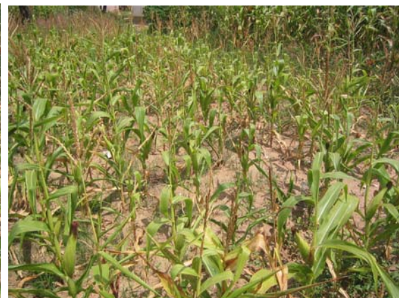
Maize growth in nearby fields without any feeding. The growth is poor and the cobs small.