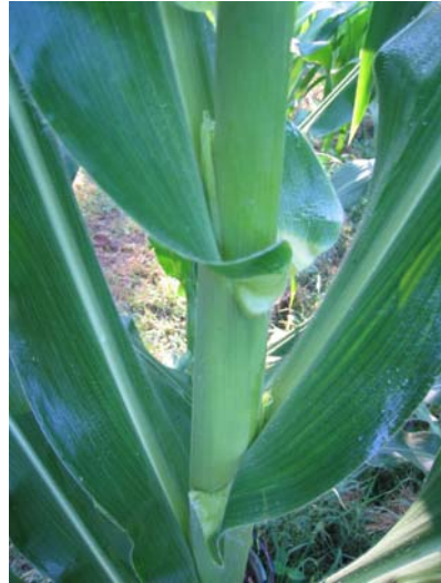
31 st January – about 2 months after planting the first tassels and cobs appear