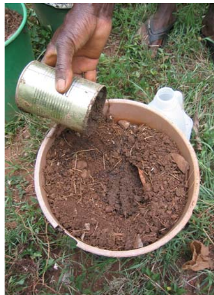
Planting day. 1 st December 2005. Fill 10 litre buckets with topsoil. Scoop out hollow in soil and add 125mls neat urine. Add one pea tin full (500gms) toilet compost into hollow. The urine applicator is a plastic pill bottle fitted with wire handle which contains 125mls of liquid.