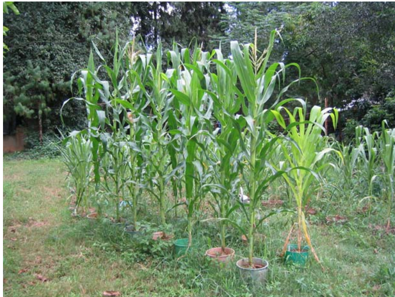
4 th February 2005. Most plants are now tasselling and young cobs forming. Note the control with no urine now falling well behind. At this stage 1000mls of urine has been applied to each plant. Urine application continues at the rate of 125mls per plant per week.