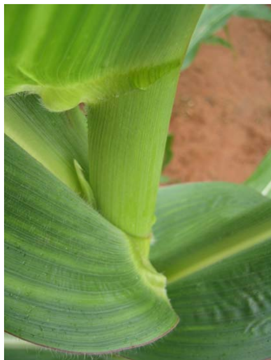
17 th January 2005, first signs of tassel (left) and cob (right).