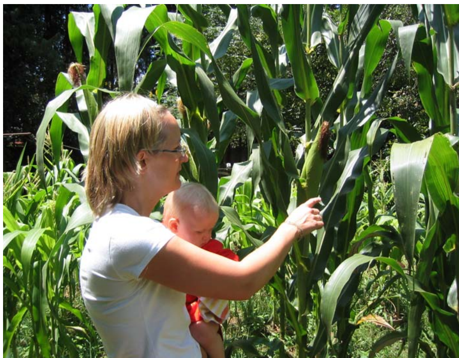
Urine fed plants growing on buckets about 13 weeks after germination

As a general rule of thumb, any urine which is added to the maize plant will have a beneficial effect. The poorer the soil, the more noticeable the effect. The addition of compost also helps, not only in providing some nutrients, but also in providing a good planting medium and soil organisms for converting urine nitrogen. Also to a certain extent the compost improves water retention, although if small amounts of compost are used, as in this case, this will have only a minor effect, since the root system eventually extends over an area and depth well beyond the compost zone. In the end the final yield depends on a number of important factors as well as the provision of adequate amounts of urine. Adequate sunlight is required and good drainage of the soil to avoid “wet feet.” Also the best maize plants grow where only one plant grows in each planting station. Also if secondary shoots develop on the stem, they are best removed so that each plant has only one main stem. The amount of urine or nitrogen applied will influence the number of cobs which form. Normally a single cob may form, but if the amount of nitrogen applied is generous two (or more) cobs will form.