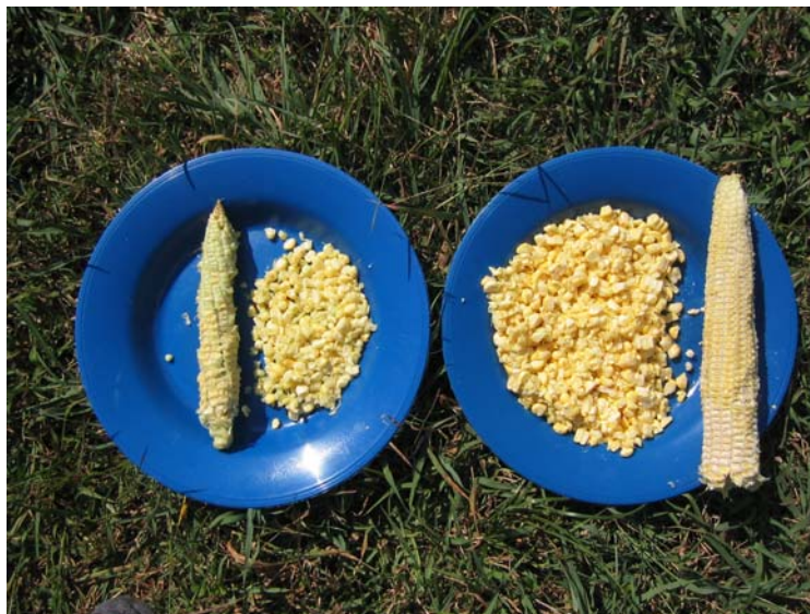
On a plate – grain yield from untreated maize (50gms) and maize fed with urine (250gms).