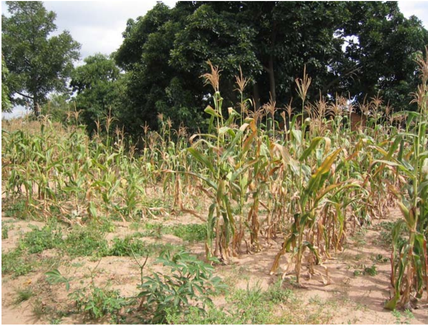
On the left the plants in the control section not treated with urine. On the right the urine treated section