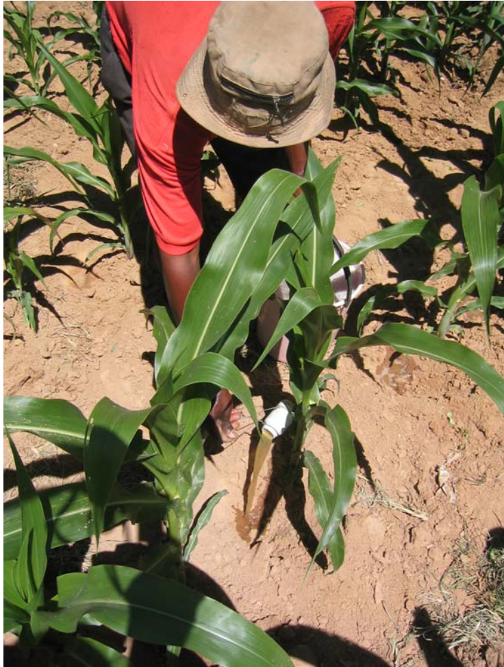
Applying the 125mls of urine in a hollow next to the plant. Best to cover over after application. 125mls are added weekly to each plant, the last 2 applications are added fortnightly to make a total of 1000mls for each plant. This is equivalent to around 5gms nitrogen.