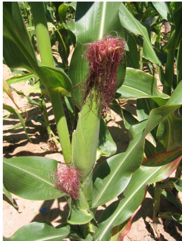
Healthy lines of maize with healthy cobs growing in treated zone on 31 st January 2005. On the right two cobs are growing, revealing that the urine application as per the schedule is adequate. On this day the final 125mls of urine was added making the total application one litre per plant. The first application was made at planting, the second to 6 th application a week apart. The last two applications were spread a fortnight apart. This regime carries the application of urine nitrogen into the grain filling stage.