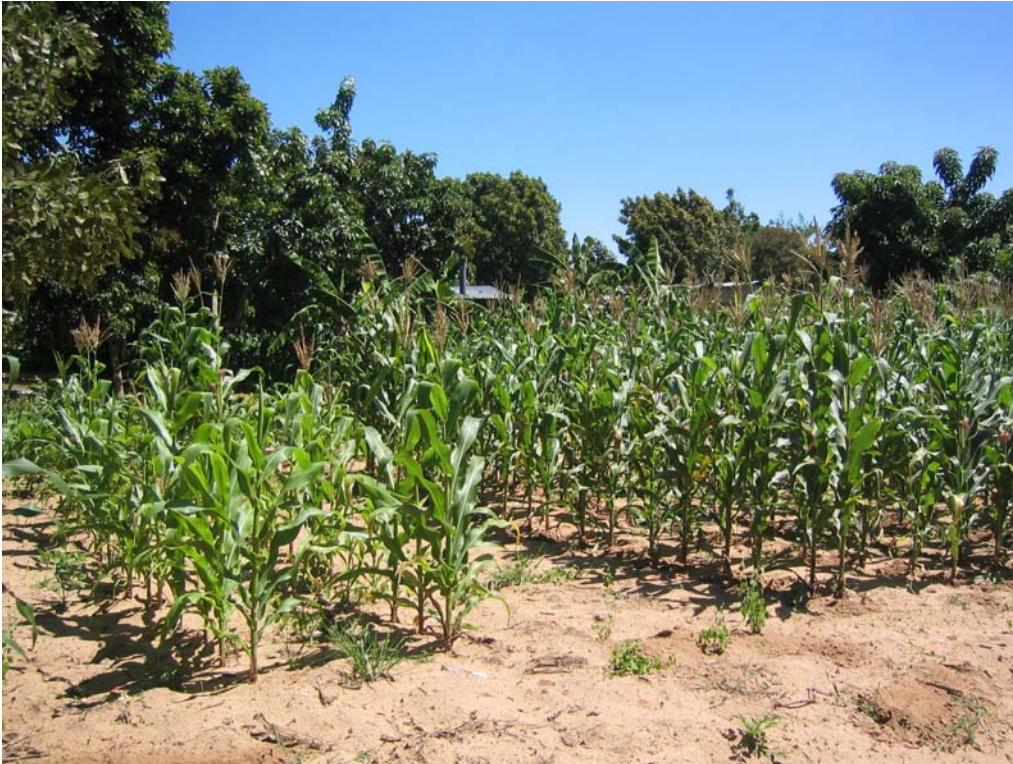
This photo was taken 31 st January 2005 at the time when the last of the urine was applied. In the treated area (right) the growth of maize has been good and cobs are already forming. On the left the untreated area shows smaller and paler plants with little cob formation.