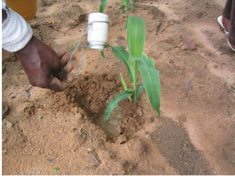
If two seeds had germinated, which was normally the case, one was removed and planted elsewhere. Adding the second 125mls application of urine to the young plant.