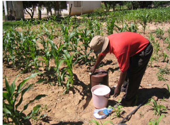
Digging small hole near to plant step prior to urine application. On the right, the urine has been stored in the 20 litre plastic container. It is poured into a bucket and then dispensed with the small pill bottle dispenser next to each plant.