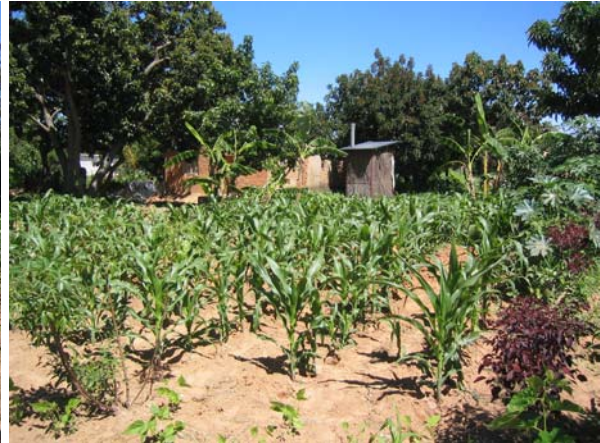
Photos taken on 3 rd January 2005. On the left photo the plants on the lower left were not treated with urine. Plants in mid picture and right had been treated. The difference is obvious. On the right photo, the lush growth of plants following urine treatment is clear to see.