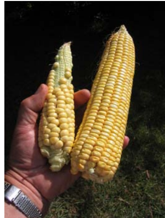
A display of the cobs produced. The single cob on the left was not fed with urine and weighed 112 gms. The treated cobs show a mean weight of 302.61gms, about three times the weight of the untreated cob.