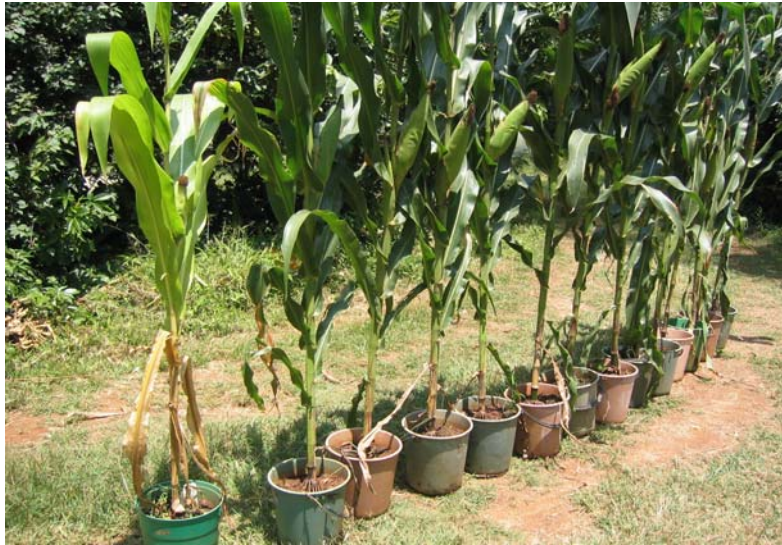
The 14 buckets lined up, the nearest with a plant not treated with urine, the rest treated with 1500mls urine. Urine application followed a schedule, most 125mls once a week. Buckets required regular watering if there was no rainfall.