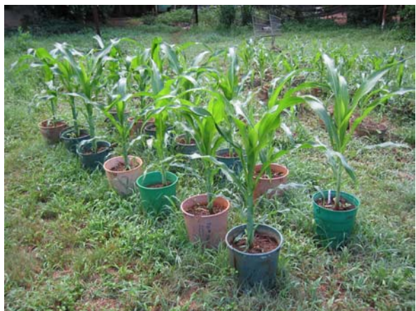
Left photo plants on 25 th December. Right on 5 th January.