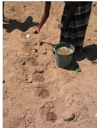
Using a dispenser, 125mls of urine is added to every hole