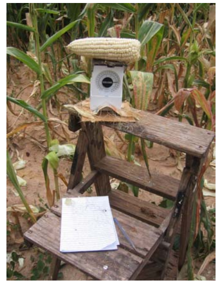
Reaping and measuring the maize cobs