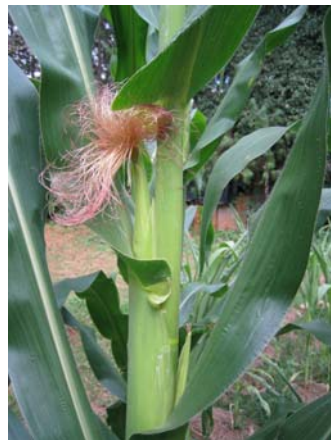
4 th February 2005. Healthy plants. Each of the treated plants has now been given 1000mls urine. Urine application is continued well into the grain filling period of the cob. On the right note the “silk” at the tip of the young cob.