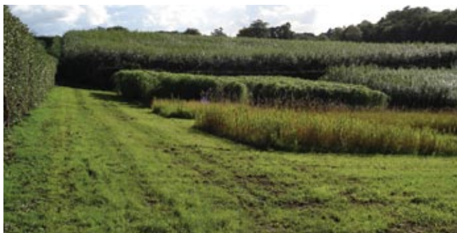
Willow short rotation plantation, Sweden