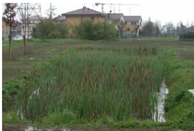
The detention pond