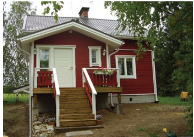
Finnish house with a dry toilet indoor