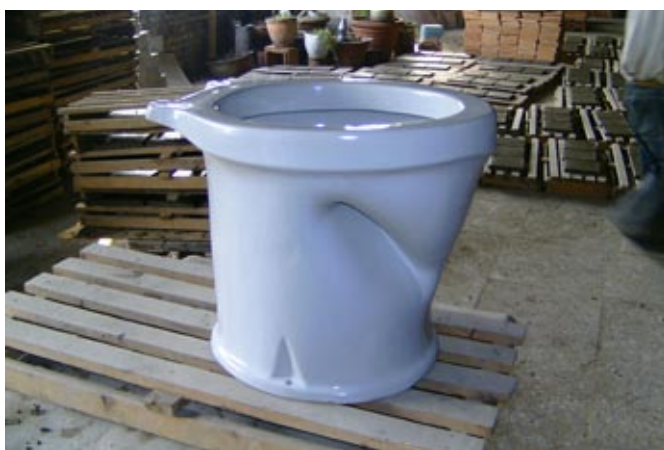
Dry toilet and urinal, Georgia