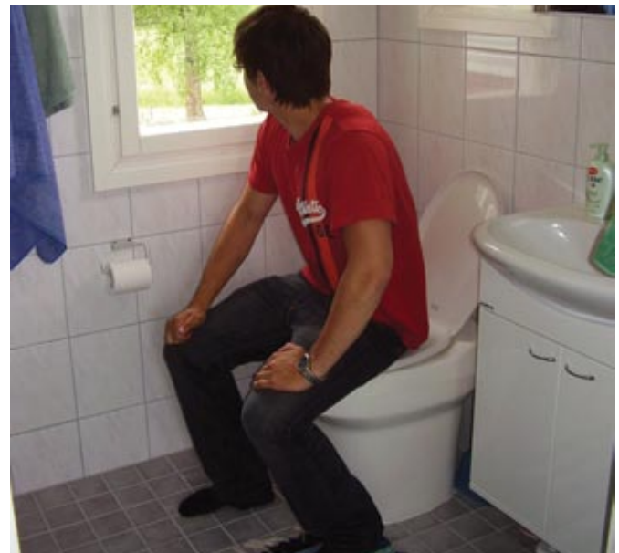
Finnish dry toilet