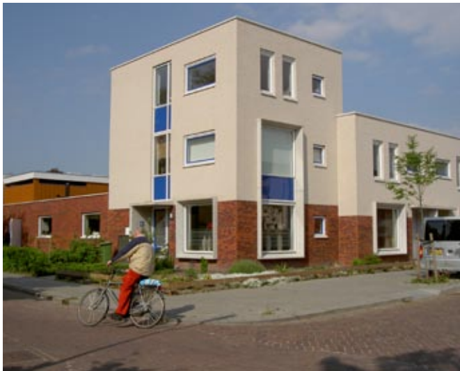
Sneek, the Netherlands