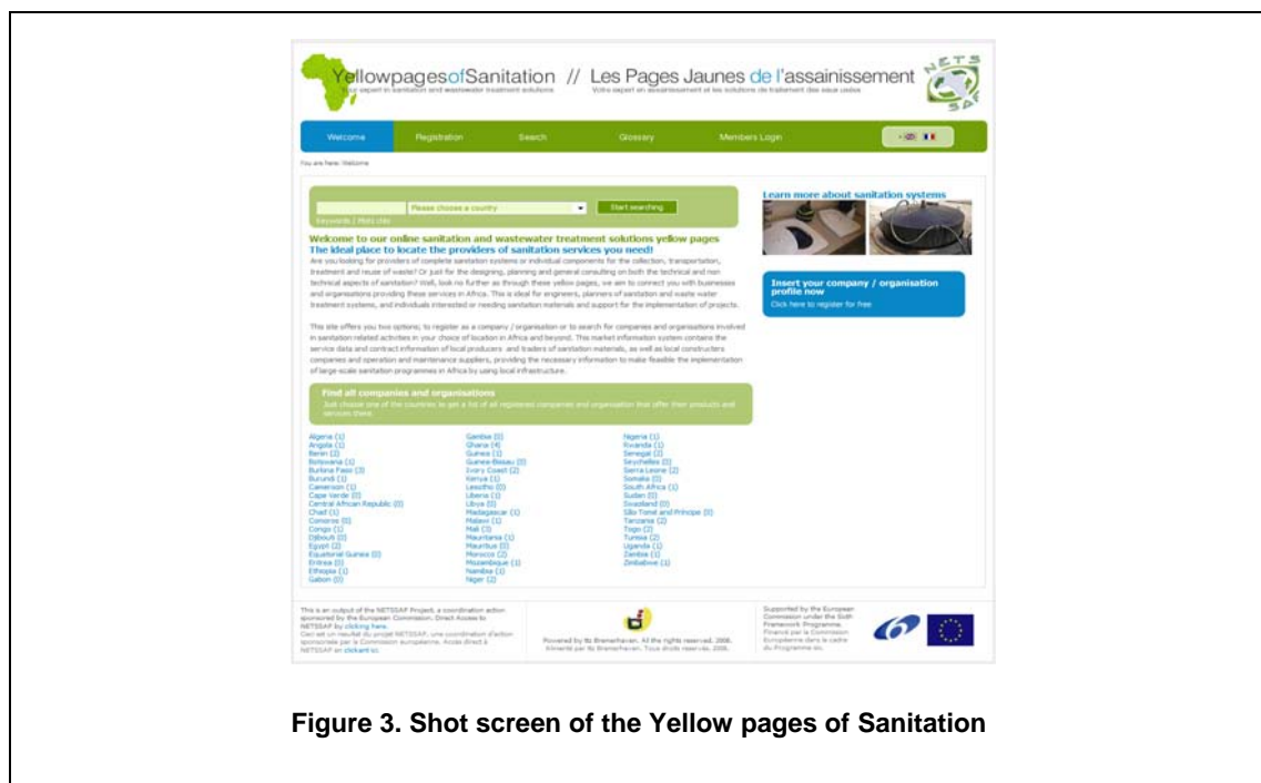
Figure 3. Shot screen of the Yellow pages of Sanitation