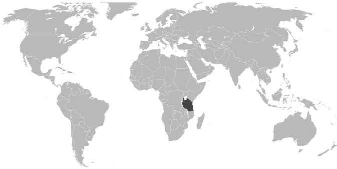
Fig. 1: Project location