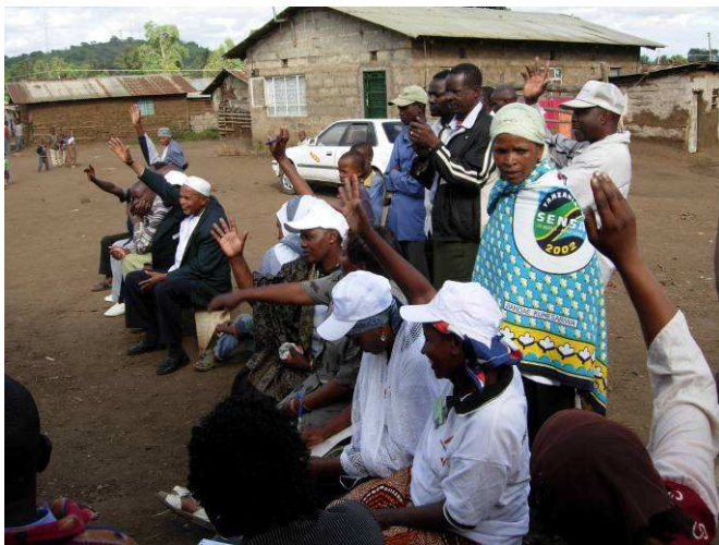
Fig. 4: Stakeholder meetings in Daraja II ward.

The selection and implementation of urine diversion dehydration toilets (UDDTs) in Daraja II primary school was based on a baseline survey carried out by the ROSA project and a series of stakeholder meetings (Fig. 4) to discuss sanitation challenges within the ward. Daraja II primary school was chosen as it was considered that it would bring impacts to the students and also community around the school. Due to limitations of resources (finance) it was decided that demonstration units should be designed for only members of staff (56 teachers) in the school.