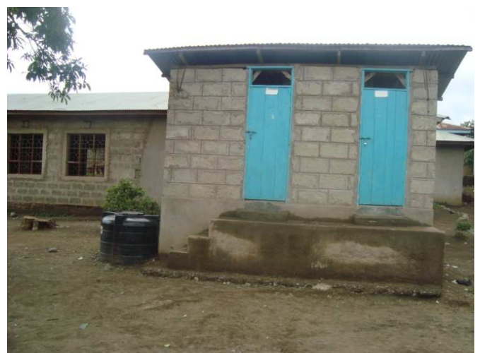
Fig. 3: UDDT toilet block (2 cubicles with 2 vaults each) made of concrete blocks in Daraja II primary school. The plastic tank for urine collection can be seen on the left side of the toilet. All pictures in this document are from the ROSA project in Arusha 2008-2010.

The project area (school) is located in one of the ROSA project pilot wards namely Daraja II in Arusha. The school has a small land area of less than two hectares (19,600 m 2 ) with pit latrines being used for excreta management. The school has a total enrolment of 2,457 students who share 17 pit latrines.