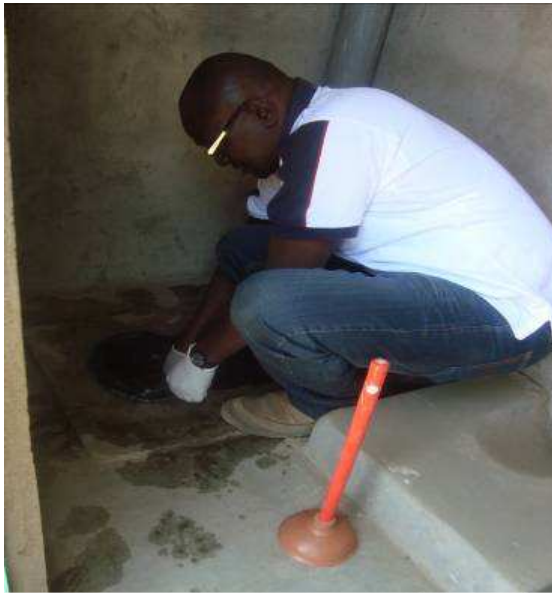
Fig. 8: ROSA project staff unblocking urine pipes at Daraja II primary school UDDT.