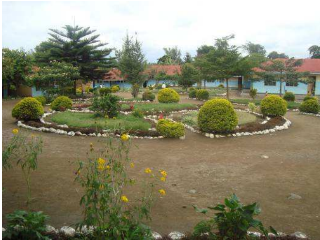
Fig. 7: Flowers in school compound fertilised by urine from UDDTs.

It is expected that in future urine and faeces will also be applied in other areas of the municipality where urban agriculture is carried out. Although this has not taken place yet, a ROSA project staff member from the municipality has established a section in the sanitation department to deal with the resource oriented issues in the future.