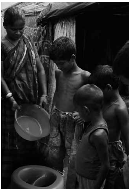
A family in the slums inspects the new toilet that can fit in a small room and looks pretty (artist impression).