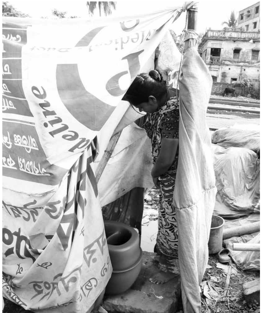
A typical make-shift toilet with new mobile MoSan toilet inside it (artist impression).

“In the last few months, I had been answering many questions about the design and the concept again and again via individual e-mails, says Mona