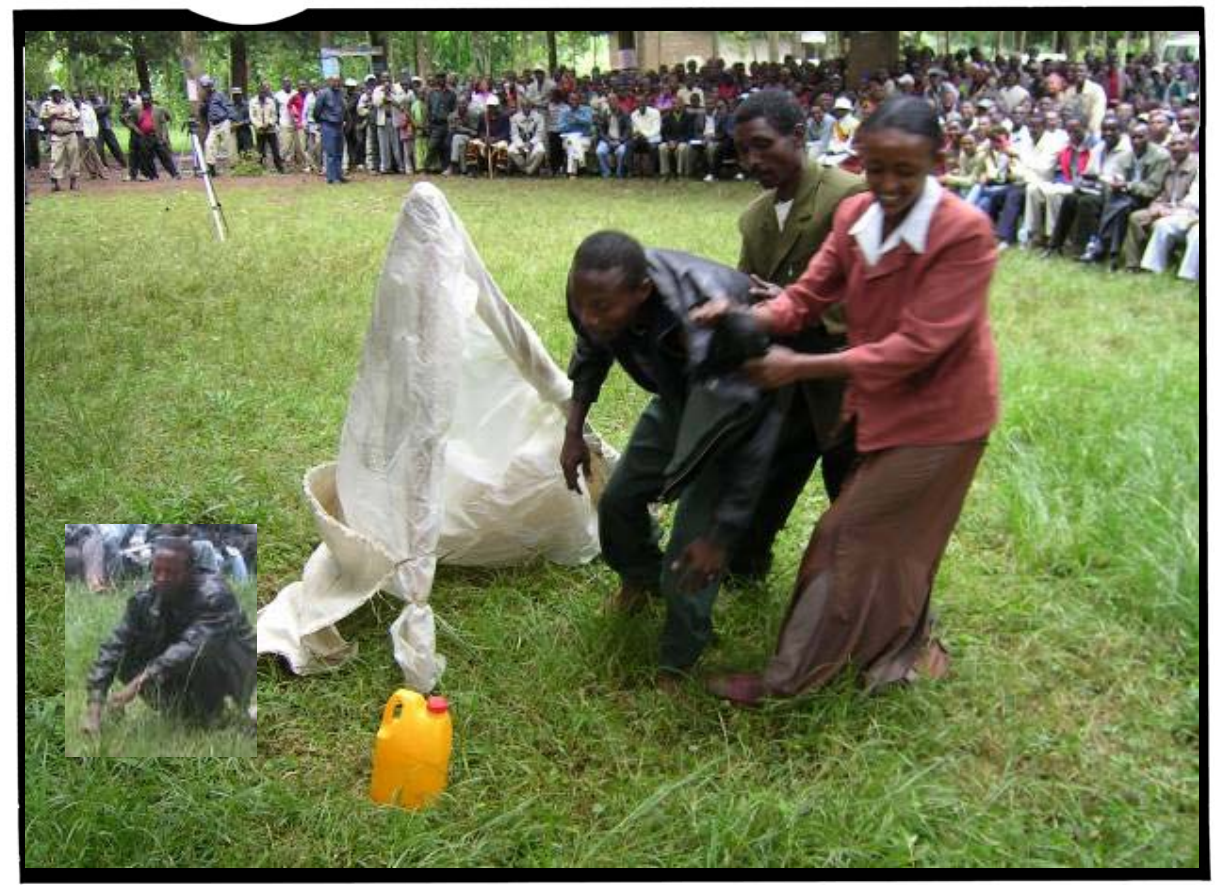
Community members demonstrating in drama how they punish open defecators

The kebele Health Extension Worker, Village Health Communicators, community natural leaders and community members who worked with commitment to end open defecation in their kebele were awarded certificates.