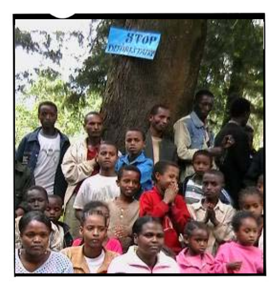
Children sheltered under the shade of the tree where 'stop deforestation' is posted are attending the ODF celebration.

And a slogan posted on a big indigenous tree reads, 'stop deforestation!' Still another slogan bears messages related to prevention of HIV/AIDS and condemns stigma and discrimination on PLWHA. These suggest that the sanitation and hygiene efforts also have multiple edges.