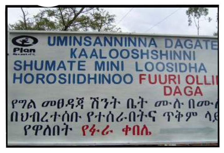
Signboard with messages that recognize Fura 'open-defecation-free'

The school and its surroundings were adorned with slogans and mottoes that magnificently promote the importance of sanitation and hygiene. The signboard prepared with the support of Plan Ethiopia Shebedino Program Unit as recognition to the community reads, "Fura: the kebele where all households constructed pit latrines on their own initiative, and where all use latrines, saying 'no to open defecation'". Another slogan reads, "Bury faeces not people!" The other reads, "Fura enters the New Ethiopian Millennium open defecation free!"