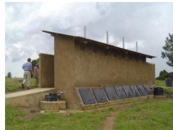
Photograph 2 - Rear view showing access panels