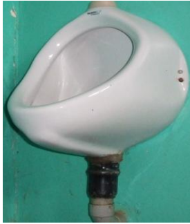
Photograph 3 - Urinal inside the pilot toilet, Rukungiri