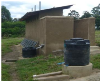
Photograph 1 - 4-stance Institutional Ecosan with urine container & hand washing facility

As the first emptying cycle for several of these installations draws near, the latrines are all being used carefully and hygienically. Users add wood ash after use; liquid separation and unassisted venting are evidently effective, as there is no bad odour and no flies. Urine is already proving its value as a fertiliser, specifically for maize, banana and green vegetable crops. As might be expected, children's/students' toilets are filling up first! In short, all are performing well to date.