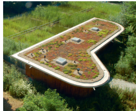
Image left: View of a soil filter for rainwater evaporation and a visitor centre (with green roof), housing a multistage greywater recycling facility (close to Potsdamer Platz, Berlin)