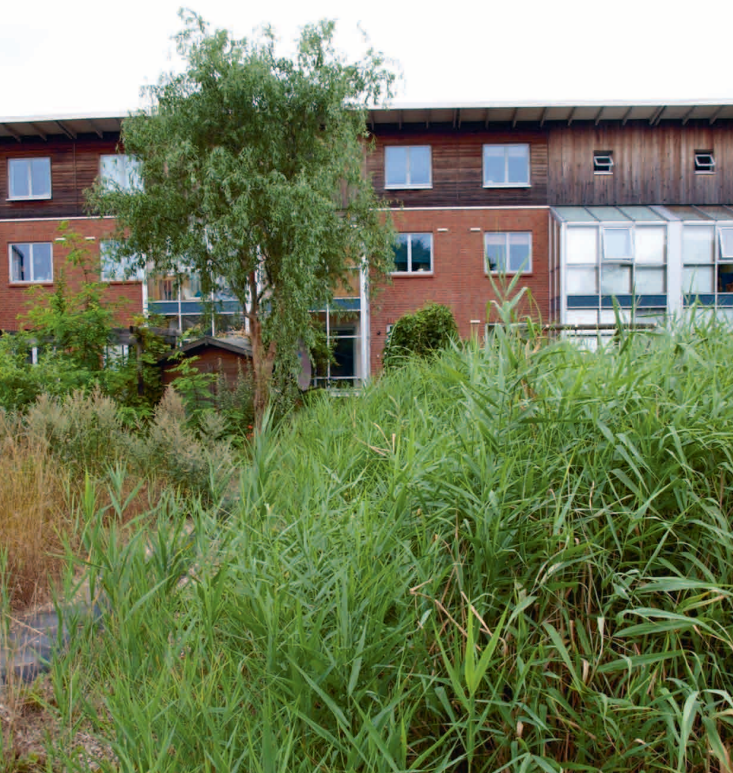
Image left: Constructed wetland for greywater treatment at the Lübeck-Flintenbreite settlement