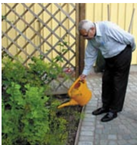
Household application of urine

If available, local recommendations for commercial mineral fertilizers, urea or ammonium, can be translated to the use of