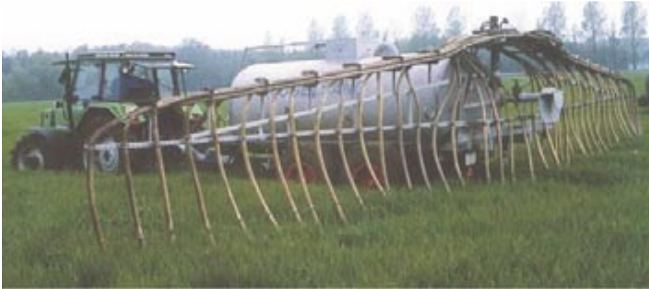
Urine application before sowing on a large scale (SLU, Sweden)

urine. The nitrogen (N) concentration of urine should be analysed. Otherwise it can be estimated at 3-7 g N per litre. If no local recommendations can be obtained, a general rule of thumb is to apply the urine produced by one person during one day (24 hours) to one square metre of land per growing season (crop). The urine from one person will thus be enough to fertilize 300-400 m 2 of crop per year and even up to 600 m 2 , if dosed to replace the phosphorus removed by the crop.