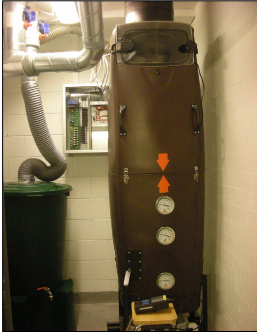
Picture 1. Dual-layer dry toilet composter (right) with Naturum urine tank (left) and gas control system (back)