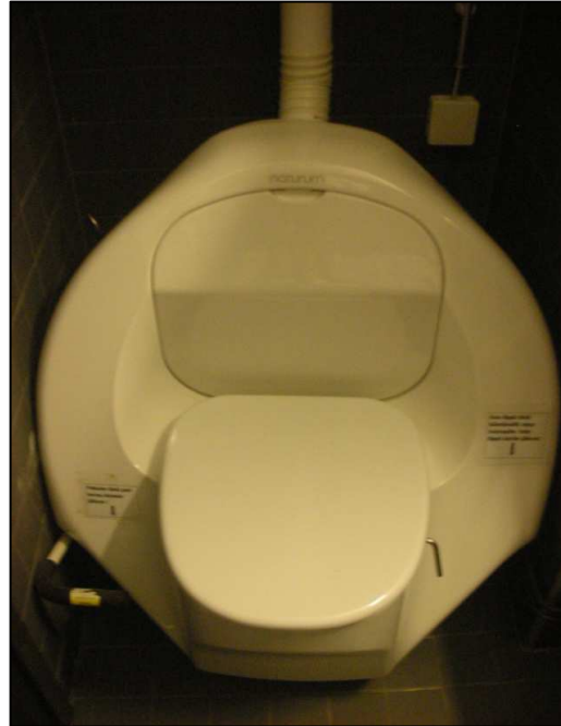
Picture 2. Naturum dry toilet