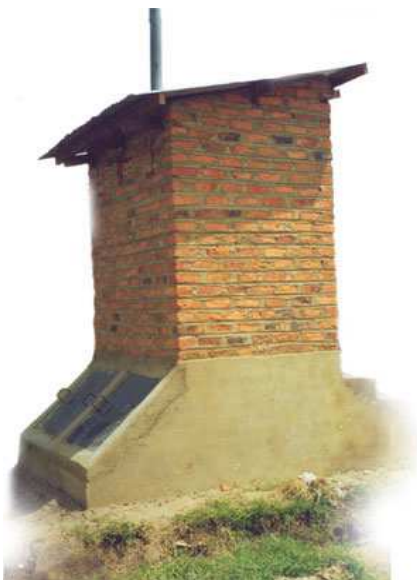
Fig. 4: A household ecosan toilet (UDDT).

The settlements are semi-urban, and concentrated along roads with buildings close to one another.