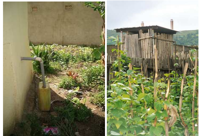
Fig. 8: Urine collected in a urine tank and used as pesticide and fertiliser on crops.

Faecal manure is also used in agriculture although the quantity collected in a year is too little to sustain the volume of agricultural activities in that particular year.