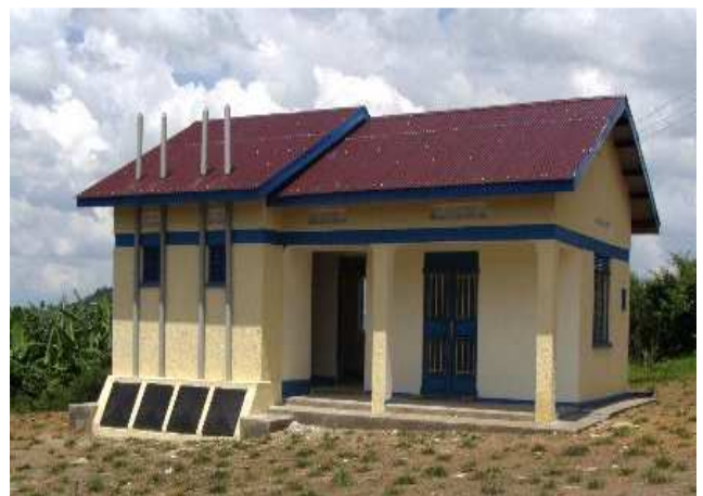
Fig. 3: Inhouse UDDTs constructed in semi-urban areas.