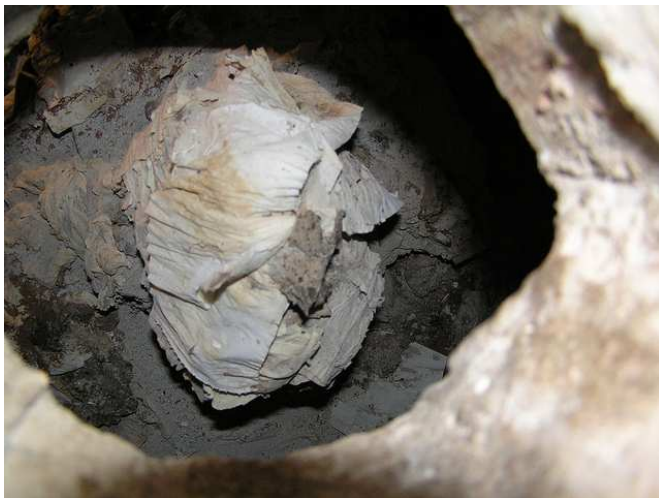
Fig. 6: Top: Doubled chamber UDDT with only one chamber in use at a time. The other urine diversion squatting pan is kept covered. Bottom: Ash and toilet paper is added to the vault by the user.