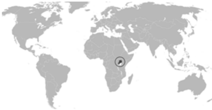
Fig. 1: Project location