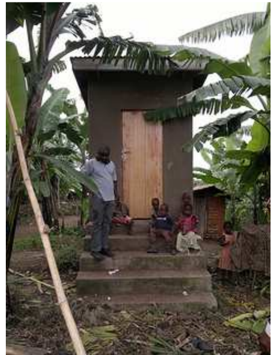
Fig. 5: UDDT constructed for a household where the by-products from the toilet are used in the surrounding banana plantation.

before opening the water supply. In total five demonstration ecosan units are constructed in each trading centre: for interested institutions (schools, mosques etc.) and private persons (ideally leaders in the community).