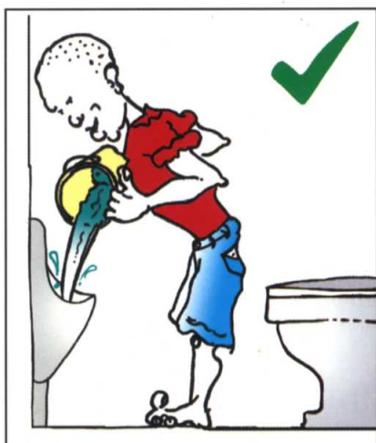
7. Clean the urinal with fresh water. Do not use disinfectants.