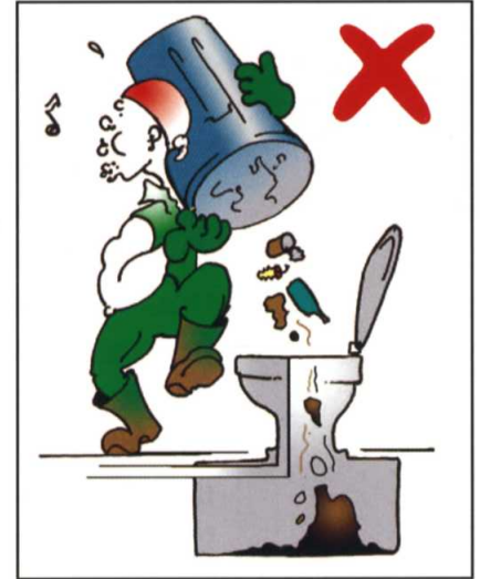
6. Do not throw rubbish into the pit.