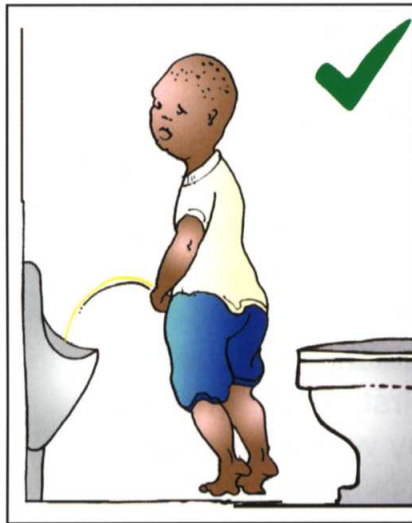
5. Men and boys must use the separate urinal.