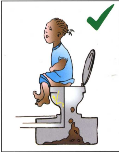
1. Faeces are deposited into the back of the toilet bowl, and ladies urinate into the front part.