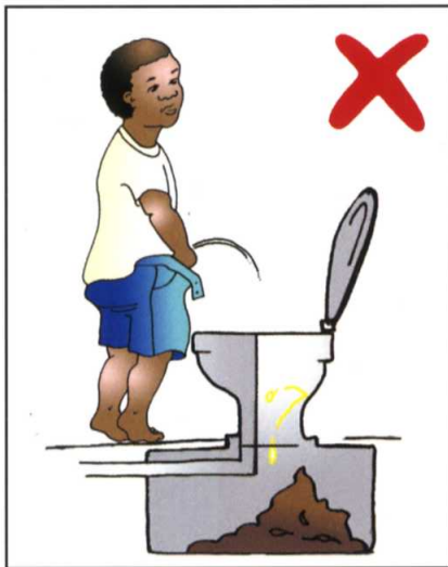
4. Males must not urinate into the back of the toilet, use the separate urinal.