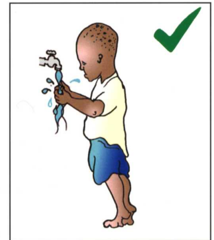
9. Always wash your hands after using the toilet.