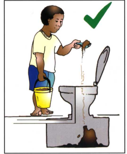
3. Ash or sand is thrown over faeces after each use. Do not pour water into the pit.