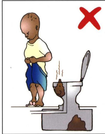
2. Do not defecate into the front of the toilet.