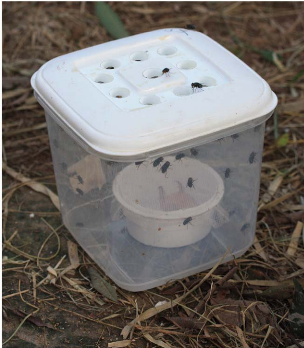
Figure 1. Optimal trap for collecting C. putoria . doi:10.1371/journal.pone.0050505.g001

total area of entrance holes was the same for each trap ( F = 3.25 , df = 2 , p = 0.06 ), if traps had cones or not and were left overnight ( F = 0.843 , df = 2 , p = 0.37 ), the shape of the trap ( F = 3.16 ,