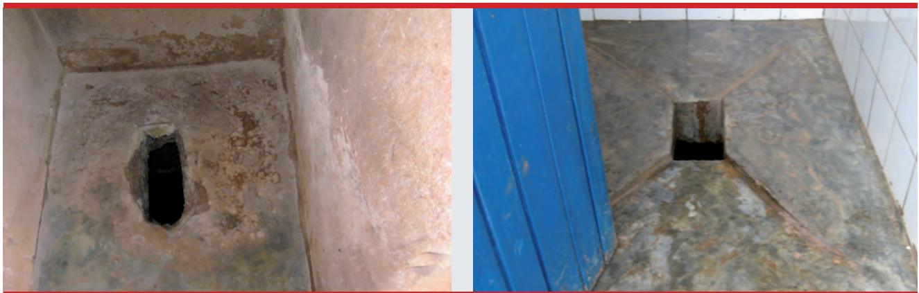
Figure 1: Examples of “acceptable” hygienic conditions

In addition to cleanliness, the number of households per toilet stance was calculated by asking households how many other households used their sanitation facility. The number of users was then divided by the number of available stances/cubicles per facility - which was recorded by inspection by the interviewers - to obtain the user load per stance.