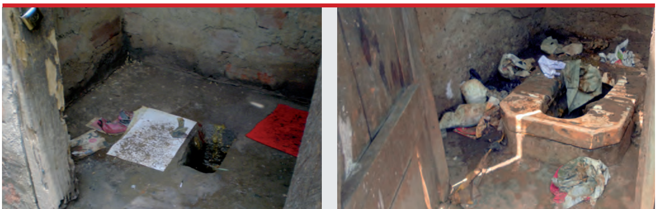
Figure 2: Examples of “unacceptable” hygienic conditions