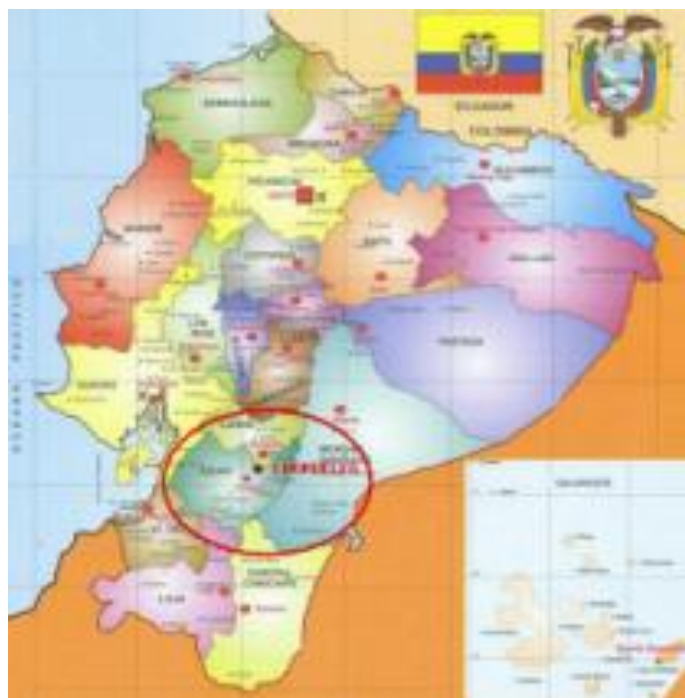
Fig 2: Map of Canton Chordeleg Please

The communities' populations vary from 500 to 1200 inhabitants. In each dwelling normally live 5 to 6 people. The population density reaches from 3 to 12 persons per hectare and the dwelling density is between 0,63 and 2,4 houses per hectare. The socioeconomic standard of the communities has been decreasing in the last years when? due to a vicious circle of general national economical problems, reduced crop yield and a high migration rate, which concerned especially the low income families.