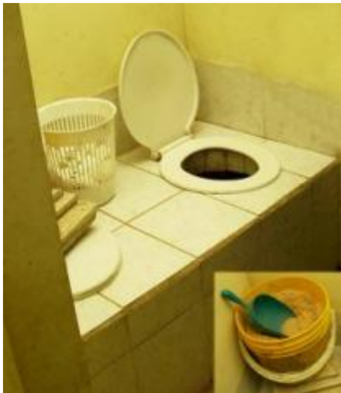
Fig. 5: Platform toilet and drying material

A second design included a urine-diverting toilet. The volume of the chambers decreased to 0,85 m 3 . Design parameters based on experience values.