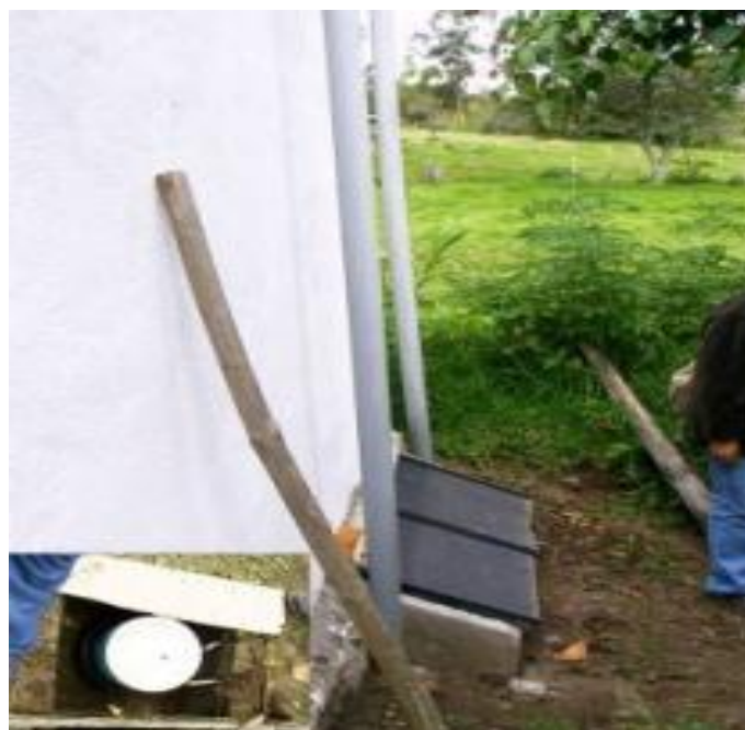
Fig. 4: Storage chambers for faeces and urine storage container

Greywater is disposed directly on the orchards. This type of solution has been implemented in the dwellings of 11 families in the vicinity to the centre of Chordeleg.