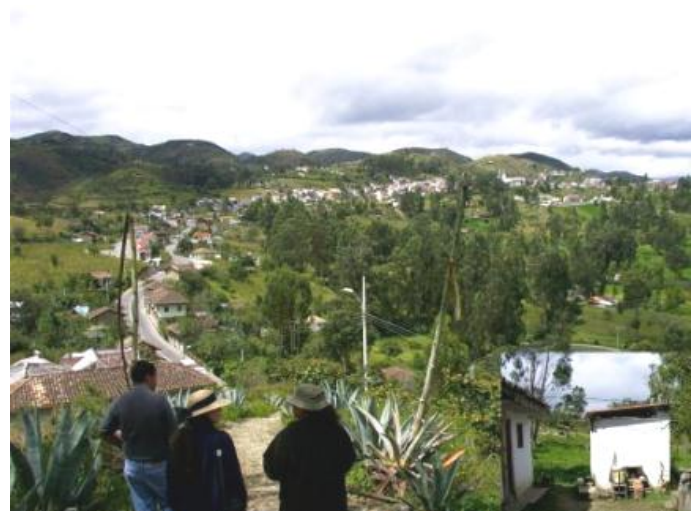
Fig. 1: Project region

The Canton Chordeleg is located east of the city of Cuenca. Its estimated population in the year 1995 was 12.200 inhabitants . The canton includes 27 communities. The main economic activities and income sources in the rural region of the canton are diverse handicrafts of toquilla straw, wool and agriculture, in the urban areas gold, silver and ceramic handicrafts.