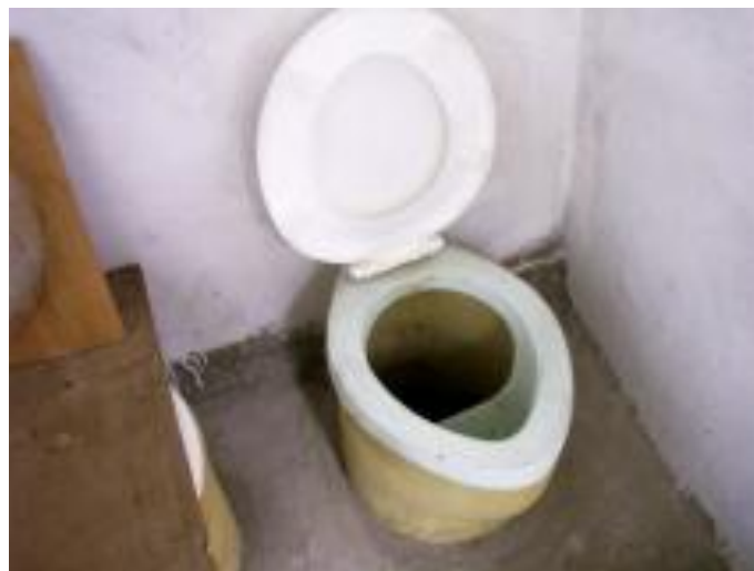
Fig. 3: Urine-diverting toilet

The ecological sanitation units implemented in Chordeleg when? are decentralized solutions without flushing. Each unit has a urine-diverting toilet, a washbasin and a shower.