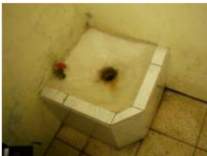
Fig. 6: Urinal for women and men

The dimension of the sanitary unit was 3,36m 2 (2,40m by 1,40m) including space for the shower and washbasin.