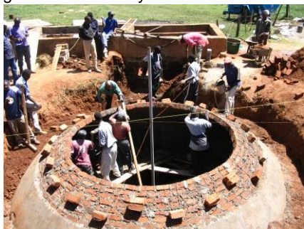
Figure 3: Construction of a biogas plant dome

can either supply motive power or generate electricity.