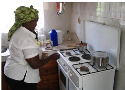
Figure 5: Stove modified to biogas use

The fundamental practise is treatment and utilization of wastes directly at the source and on the compound. Using biogas as cooking and lighting fuel in the producers' households reduces the dependency on fossil fuel and firewood. But principally it can even be supplied into the electricity net.