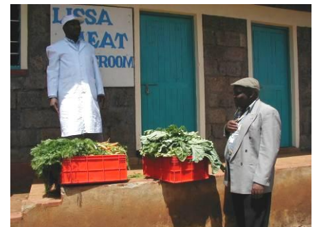
Figure 2: Vegetables produced with slurry

main household energy source has become short due to cultivation of land and destruction of the forest cover. Agricultural productivity is decreasing due to declining soil fertility. A large amount of waste and wastewater from farms is not used at all but polluting the environment. Hence cost saving and environment-friendly technologies for energy production, fertilization and irrigation are needed.