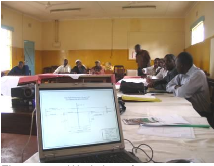
Figure 10: Workshop for constructors