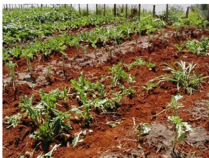
Figure 6: Slurry application on vegetable field

Slurry of biogas plants and compost are used as fertilizer or soil conditioner on the fields replacing petroleum based fertilizers.