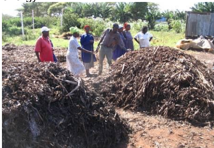
Figure 4: Compost piles

Biogas and composting technologies are easy to adopt and to apply. They can enable the agro-enterprises to not only treat waste but also add value to it by generating good quality fertilizer and energy.