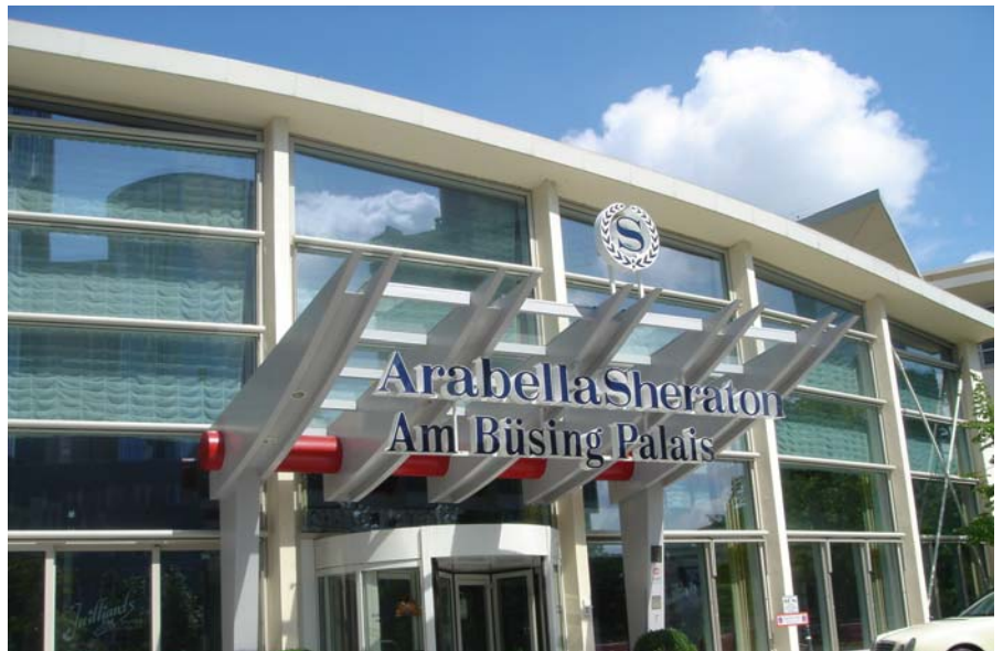
Figure 1: Hotel ArabellaSheraton, Offenbach

Executing Institution: ArabellaSheraton Frankfurt