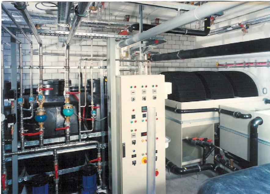
Figure 3: Biological treatment unit

efficiency of the UV-disinfection is controlled by an optic sensor. When a disturbance is detected, the greywater will not be channelled into the service water tank but to the wastewater pipes.