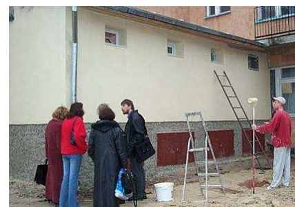
Figure 4: School toilet facility backside

Stefan Deegener of the University of Technology Hamburg, who also supervised the construction, did the design of the dry double vault urine diverting toilets. Pictures and posters of different toilet systems and a demonstration model of a double vault dry urine diverting toilet were presented during a public meeting and the preference for squatting slabs instead of seats was figured out.