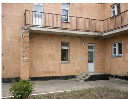
Figure 3: location for conjunction the new ecosan toilet facility with the school