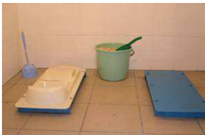
Figure 6: Finished interior of the toilet