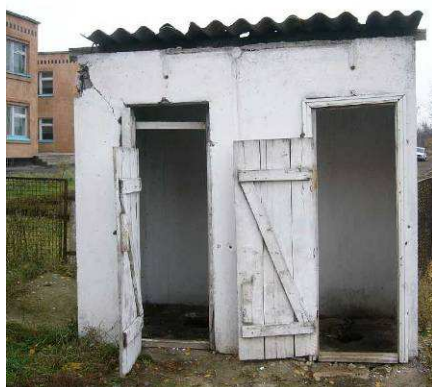
Figure 1: Former school latrine in Gozhuli

To address the previous mentioned problems and goals, in co-operation with the local partners and staff, and the TUHH an ecological sanitation pilot project was developed for the school.