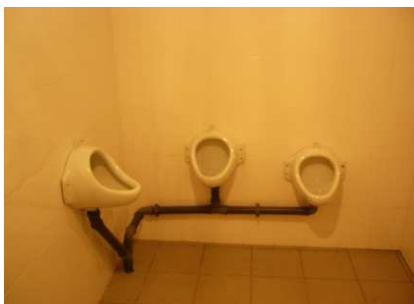
Figure 7: Urinals for the boys

Authorization for the construction was obtained from the mayor and school director/board. During the summer holidays 2004 a local constructor, authorized to carry out school constructions, started the construction of the toilet facilities.