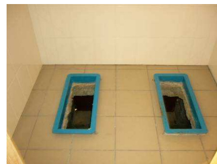
Figure 5: Interior of toilet facility; slab and cover are not yet installed