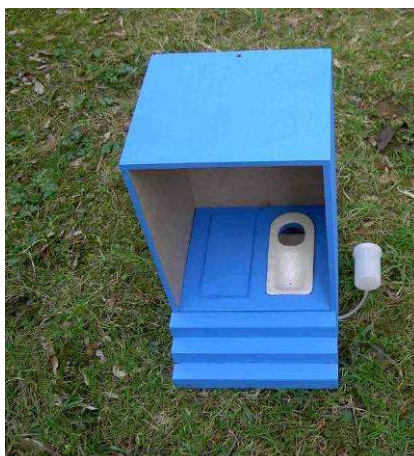
Figure 2: urine diverting toilet demonstration model

For hand washing a washbasin was rehabilitated and equipped with towels and soap.