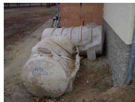
Figure 12 : Deformed urine tanks