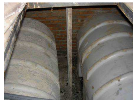
Figure 13: New tanks in a sub-surfaced chamber

The aforementioned smell problems could be improved by: