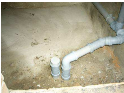
Figure 11: Piping system for changing the urine flow-in from the one to the other urine tank

The urine from the diverting-toilets and the waterless urinals is collected in a urine tank made of Poly Ethylene (PE), 5 mm. Two urine tanks of 2 m 3 each were bought. The two tanks, similar to the composting chambers, are necessary for the 6 months or longer resting time, during which most of the pathogens are killed or at least reduced.