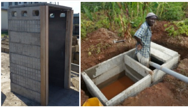
Figure 2. Pre-fabricated superstructure with low volume flushing toilet. The toilet superstructure is constructed from interlocking cement blocks enabling faster construction (left). The pour flush prototype uses low volumes of flushing water which goes into sumps (right). The same building blocks can be used to build the sumps.