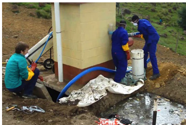
Emptying of pit latrine with vacuum pump.