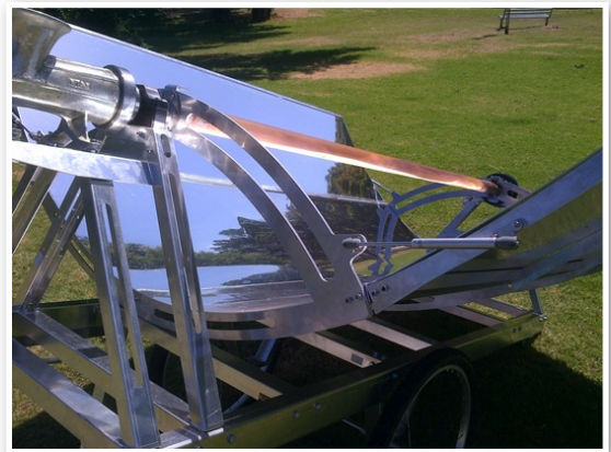
Figure 3. Mobile solar pyrolysis unit that converts faecal sludge to biochar via thermal decomposition. The biochar can be re-used as fertiliser replacement or fuel source.