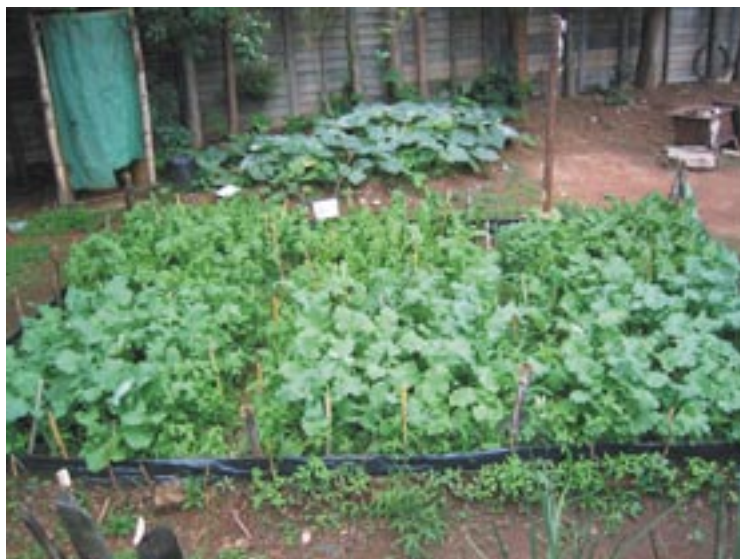
A crop of spinach four weeks after planting, using processed excreta from one family, using a Fossa alterna

Two of the three main ecosan toilet systems process the excreta in shallow pits. The third system keeps urine separate from faeces and these two products are processed separately. The methods using shallow pits are simple and relatively cheap to construct, and are thus more suited for uptake in the poorer countries of the world, where pit sanitation may already be the standard method of excreta disposal. The world of ecological sanitation has been broadened to include