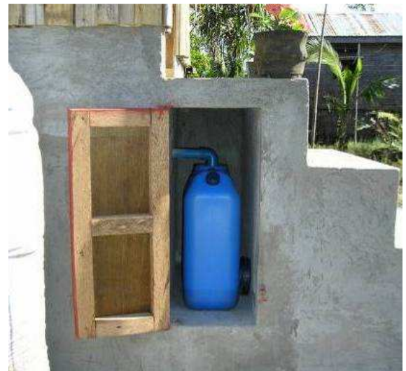
Fig. 9: Urine container, UDDT in barangay Villareal, 2007