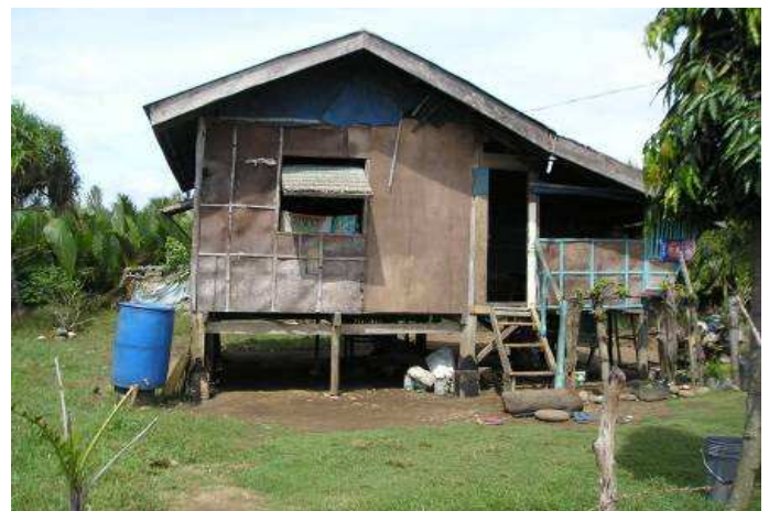
Fig. 3: House of a family with a UDD toilet, barangay Villareal, Bayawan City, 2006

Note: The focus of this document is on Phase 1 of the project (Phase 2 is only mentioned for completeness).