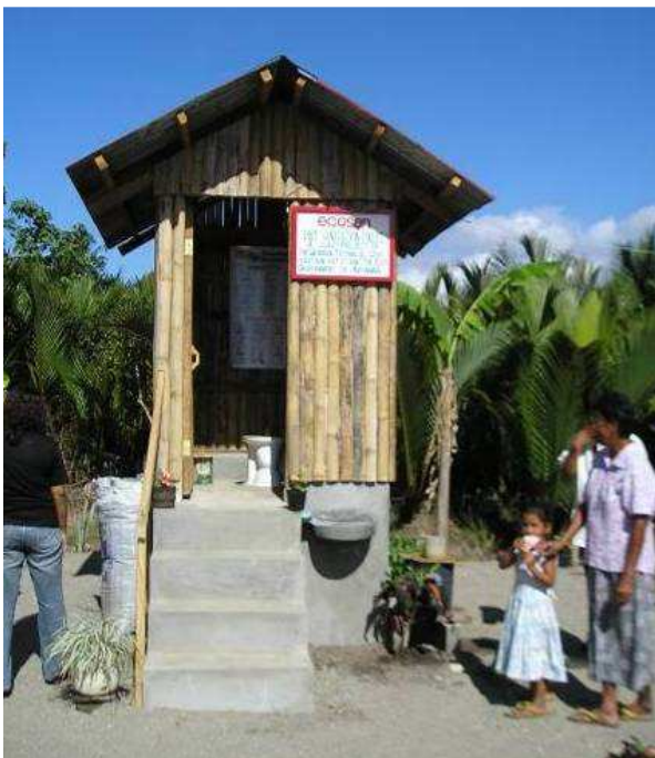
Fig. 5: Single vault UDDT, barangay Villareal, Bayawan City, 2006

The vast majority of rural households uses firewood for cooking, which means they have ash available. After defecation the faeces are covered with the ash to enhance the drying process and for optical reasons. In cases where no ash or not sufficient ash is available, carbonized rice hull 3 is used.