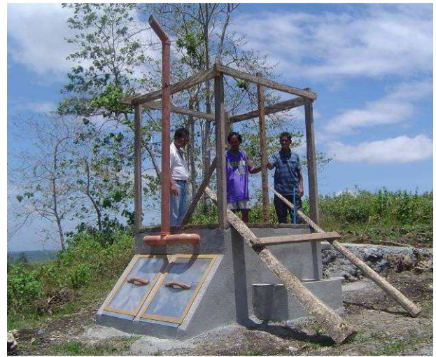
Fig. 10: Construction of a double-vault UDDT, barangay Narra, 2007

GTZ-Philippines personnel. From January 2009 onwards, monitoring of new facilities will be done by the ecosan TWG only.