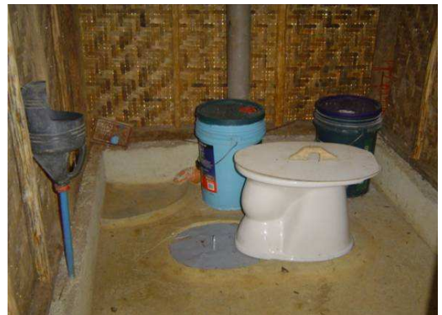
Fig. 8: Inside a UDDT, barangay San Miguel, 2008. Note waterless urinal on the left. Area for anal washing in the far left corner.

All UDDTs were built as outdoor toilets. The main reason for this was that the users felt at the beginning more comfortable with this conventional setting. Many users were concerned about insects and bad odours as it is known from simple pit latrines. Future UDDTs could also be built indoors.