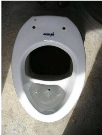
Fig. 4: Ceramic urine-diversion toilet pedestal, inside of the toilet house shown in next figure