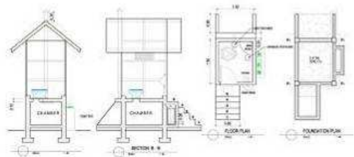
Fig. 6: Single-vault UDDT, technical drawings (source: Provincial Engineering Office, Negros Oriental, 2007)

The UDDTs are all built entirely above ground to facilitate high temperatures in the vaults and thus accelerating the drying process. Therefore the buildings have a small staircase. The number of steps varies, depending on the individual design. The standard design has 4-5 steps of 20 and 25 cm width and height, respectively.