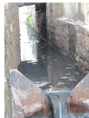
Flow measurement by 'V' Notch

On the basis of the study, recommendations were formulated and presented to RMC. The rehabilitation of pumping stations and refurbishment of oxidation ponds to receive sewage needs immediate attention followed by the refurbishment of manholes as well as pipes. For that the CCTV inspection needs to be extended to the whole sewer network (where laying pipes by open cut excavation is not feasible). A full inspection will help to get a clear picture of the actual status of the complete infrastructure, detect areas, where immediate action is required and prepare a map of priorities for refurbishment.