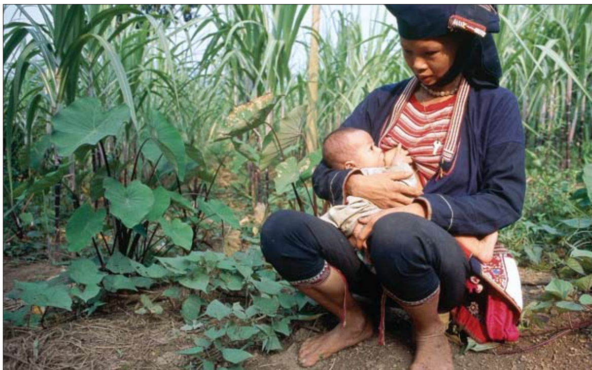
Vietnamese woman breastfeeding her child