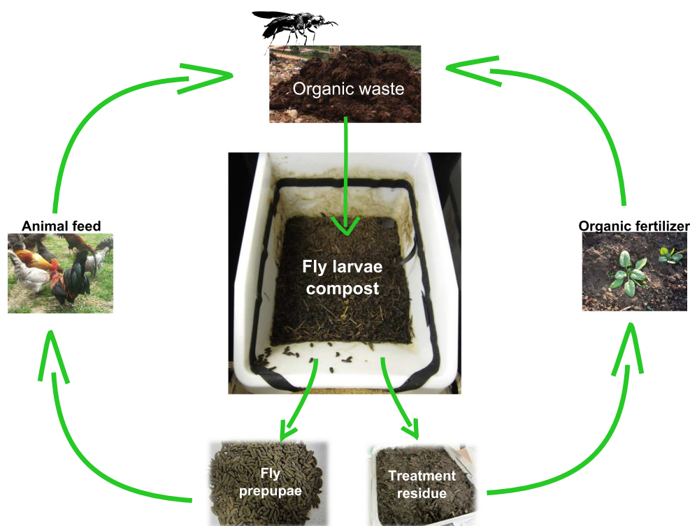
Fig. 1 A graphical representation of the concept of fly larvae composting: organic waste is consumed by fly larvae, in the sixths and final larval stage, the prepupae migrate out of the compost. The prepupae can be used as animal feed and the treatment residue used as organic fertilizer. The loop is closed when the animal manure and food waste is diverted as substrate into the fly larvae compost

Pig manure (21.1±1.7 % total solids) was collected on a pig farm in Uppsala municipality, Sweden. Dog food (Puppy Original, Pro Plan, Purina) mixed with water (21.9±0.2 % total solids) was used as the model substrate for organic waste (Vinnerås et al. 2003). Human feces were collected fresh in plastic bags and stored at -20 °C immediately upon collection. A mixture of pig manure, dog food, and human feces was prepared (4:4:2; 28.7±1.2 % total solids), divided into feeding portions, and kept at -20 °C until use.