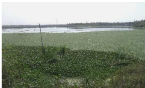
Figure 2: Water hyacinth in Bheemasandra lake

Rest of the 40% of the city is dependent on onsite sanitation systems (OSS), out of which 22% is dependent on septic tanks and 18% on pits. The public latrines are connected to septic tanks and hence are incorporated in onsite systems. Septic tanks are not contained as they are connected to open drains but pits are contained as ground water table is more than 10 mbgl.