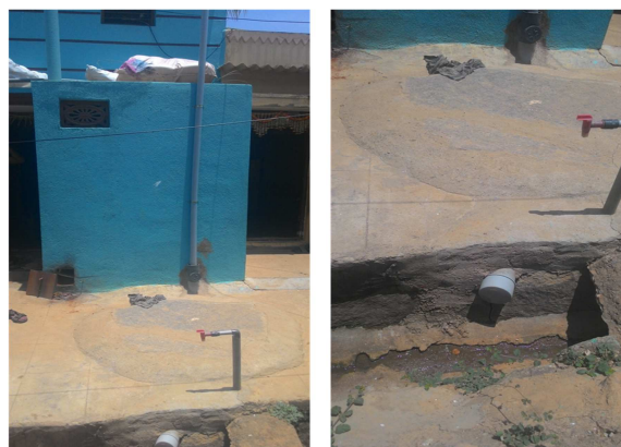
Figure 1: Toilet connected to pit with opening for emptying septage

End-use/Disposal: The emptied septage is disposed in agriculture farms; farmers dry the raw sludge and use it for agriculture. It is a common practice to use the dried sludge as compost in banana gardens and grape orchards. The local farmers collect tipping charge of 156 USD per year from private emptiers for allowing septage to dispose in their farms. Treated sewage is disposed in to Beemasandra Lake, leading to eutrophication. Untreated sewage flows in to Shimsha River and Amanikere Lake.