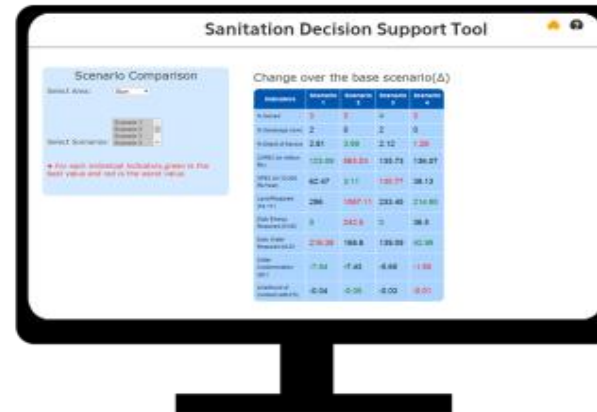
Screen 5- Scenario Comparison