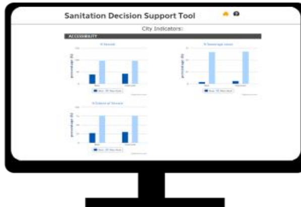
Screen 4 – Indicators-City level