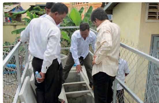
Left: Older students help to keep the facilities clean at Kraing Thnong Primary School in Phnom Penh. Right: Excited winners of a hand washing competition at Bak Kheng Primary School. Below right: Looking inside the DEWATS at Kan Tork Primary School in Phnom Penh.