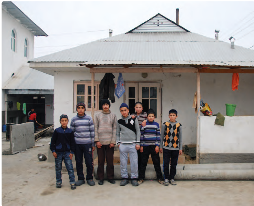
Left: Pupils in front of the 'Al-Bukhari' Madrasah (Muslim education center). Right: Pupils washing hands in Navruz school. Below right: Ablution facilities in the Madrasah.