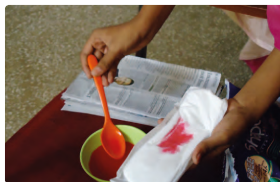
Left: Boys and girls in Sylhet (Bangladesh) playing the 'Disposal Game'. Right: 'Red Yarn Game'. Below right: Preparing for the 'Disposal Game'.