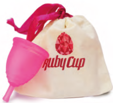
Left: Kenya Kibera Slum, four girls that have received a free Ruby Cup. Right: Kisumu, Kenya. Ruby Cup distribution during Global Menstrual Hygiene Day 2014. Below right: The Ruby Cup comes in various colours, e.g. in pink.