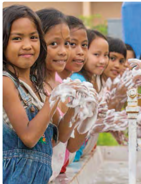
Left: School communities can enhance and beautify the group washing facility (Cambodia).