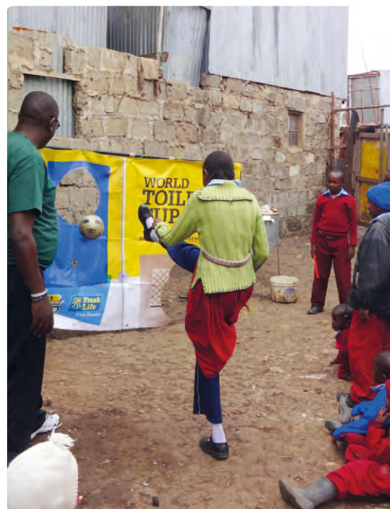
Left and right: Boys and girls competing in the 'World Toilet Cup' game in Mukuru, Nairobi's informal settlement.