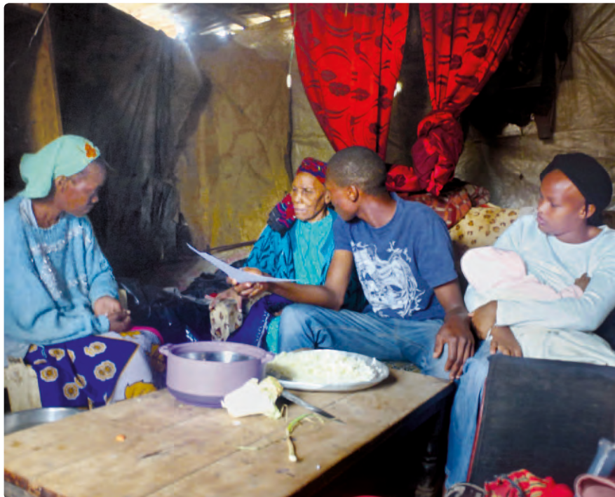
Left: Intergenerational dialogue with one of the oldest women in Mathare. Right: A water kiosk in Mathare.