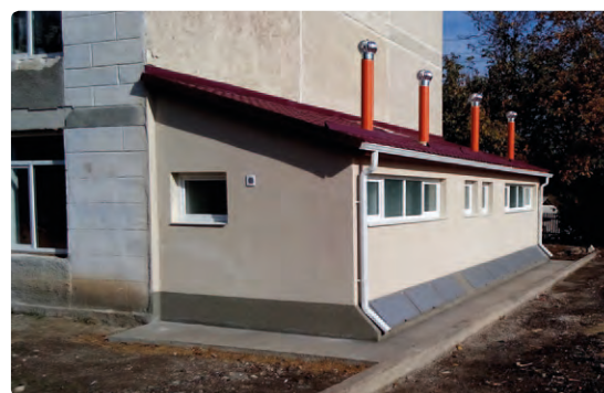
Left: Children using hand washing facilities in the Kindergarten of Carpineni village, Moldova, which has been connected to a new water supply system. Right: Teachers and senior pupils prepare for training of trainers for use and maintenance of ecosan school toilets in Soldanesti district, Moldova. Below right: New ecosan school toilet attached to the main school building of Oliscani village, Moldova.