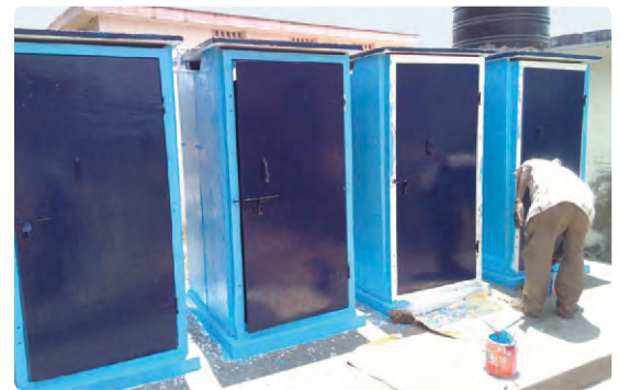
Left: Vizianagaram (Andhra Pradesh). Right: Warangal (Telangana). Below right: Dalmiapuram (Tamil Nadu).