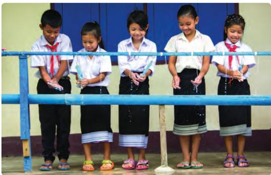
Left: Cleaning of toilets is part of daily school routine (Lao PDR). Right: Handwashing and toothbrushing is done as group activity (Lao PDR). Below right: Individual handwashing after using the toilet is encouraged (Indonesia).