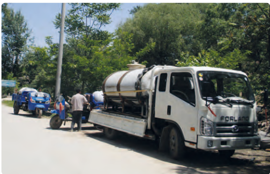
Left: Living in the orchard, Tian Shui City, 2011. Right: Speech to the pupils, Tian Shui City, 2010. Below right: Unloading urine to the small tanks of the orchard owners, Anjiazhuang Village, Tian Shui City, 2012.