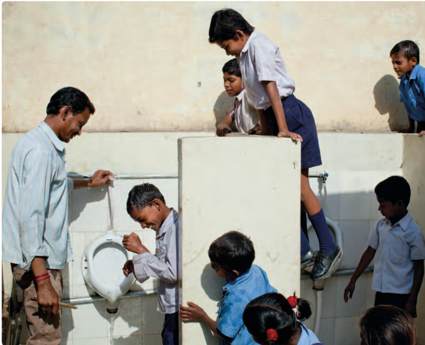
Left: Plumber installs water tap of new urinals, Raipur, India.