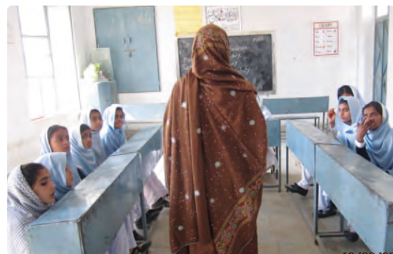
Top left: Students of Al Hamd public school, Kotla Naseer, Rajanpur. Top right: Teacher sensitizing Menstrual Hygiene Management to students of Government girls primary school, Dera Dildar, Rajanpur. Below right: Students of Government Elementary School, Raqba Nabi Shah village, Kotla Naseer, Rajanpur.