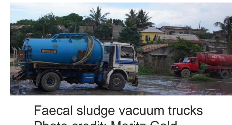
Faecal sludge vacuum trucks

Dar es Salaam, Tanzania, 03.09.2015 Field based assessment