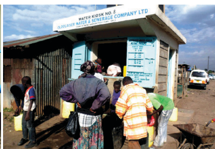
Left: Group handwashing in school in Lao PDR, right: Water Kiosk in Kenya.