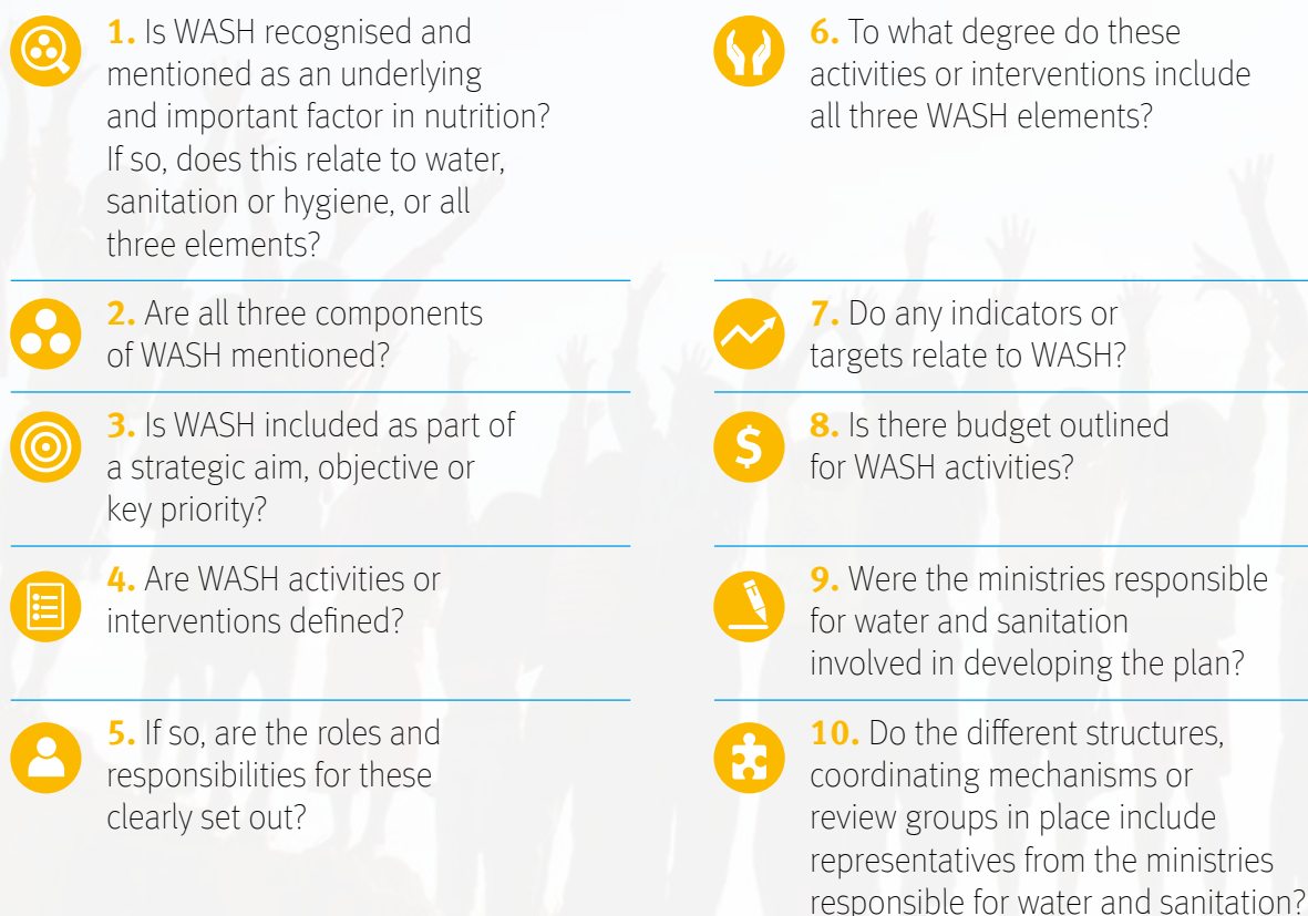
Table 1: Criteria for reviewing national nutrition action plans

Multi-sectoral national nutrition action plans were the primary focus of the analysis due to their specificity and role in directing national implementation. However, to get a comprehensive picture, national nutrition policies were also briefly reviewed. The pre-defined criteria used to review plans and policies are listed in Tables 1 and 2, respectively.