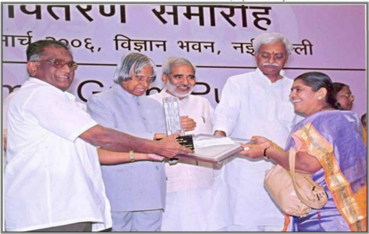
The NIRMAL GRAM PURASKAR awarded to SCOPE for its exemplary work on sanitation for the year 2006