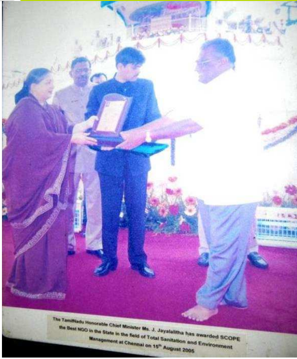
The Tamilnadu Honorable Chief Minister Ms. J. Jayalalitha has awarded SCOPE the Best NGO in the State in the field of Total Sanitation and Environment Management at Chennai on 15 th August 2005