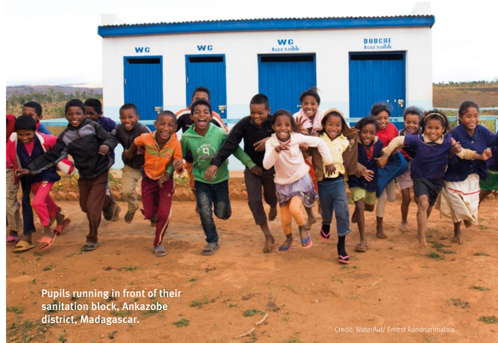
Pupils running in front of their sanitation block, Ankazobe district, Madagascar.

WASH is essential to preventing undernutrition. On the treatment side, results of recent studies show that a combination of WASH services and hygiene awareness-raising, delivered at household level, consistently improves the efficacy of treatment (researched), and may have a positive effect on relapse and the cost-effectiveness of the approach (under research). 12