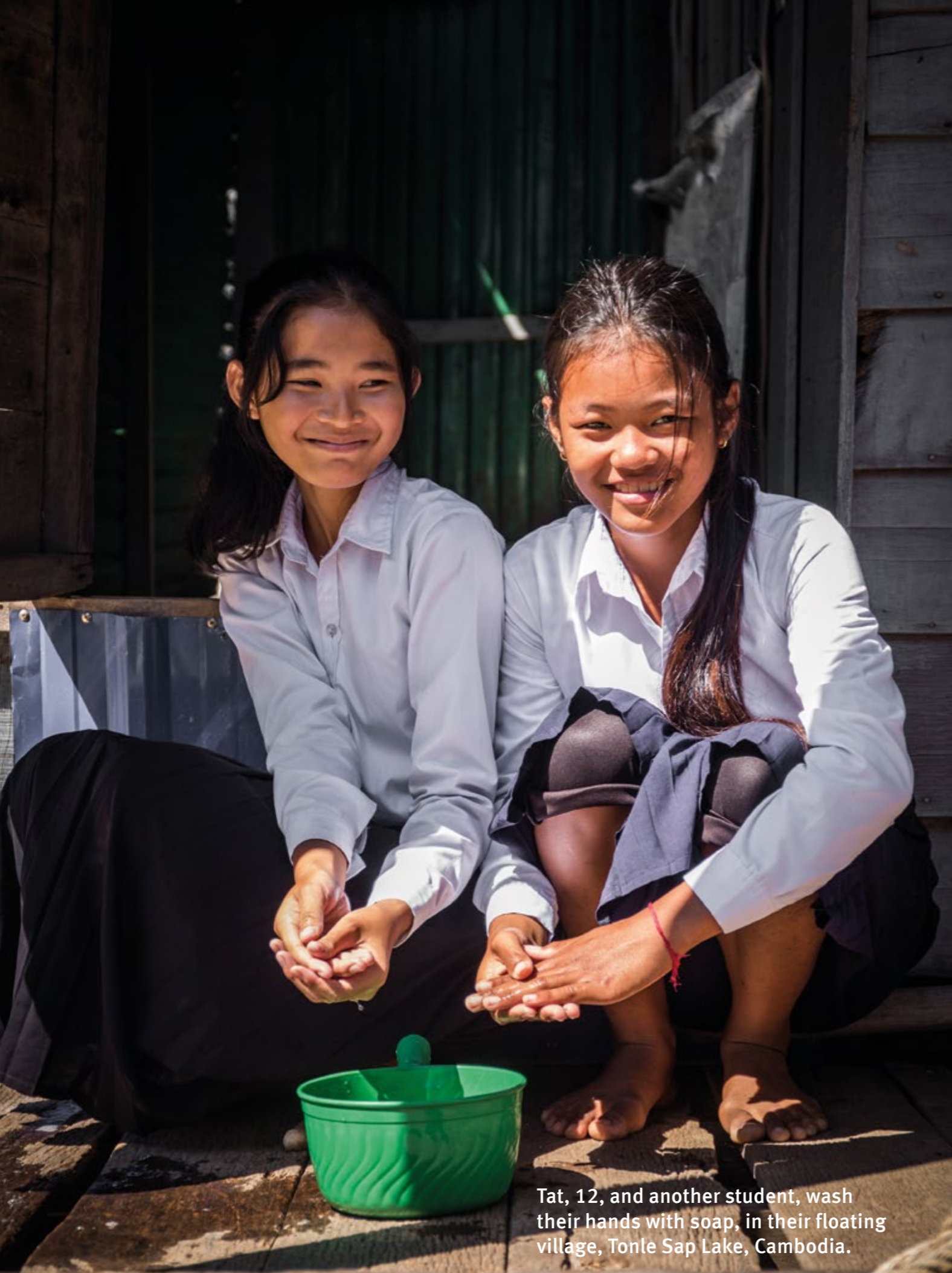
Tat, 12, and another student, wash their hands with soap, in their floating village, Tonle Sap Lake, Cambodia.