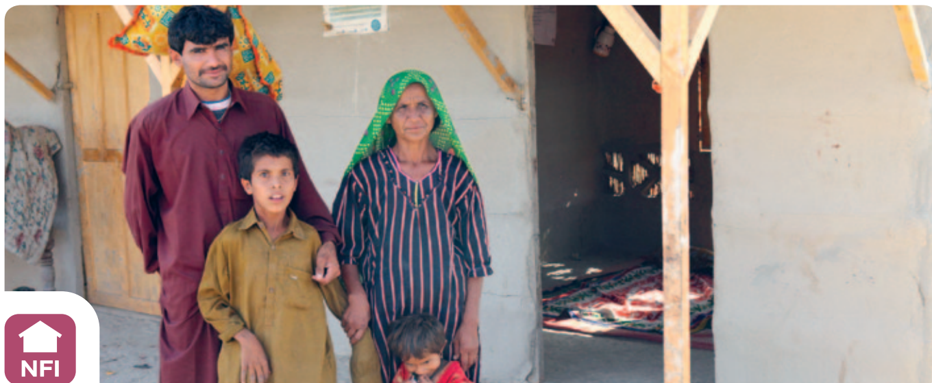
Brice Blonde/Handicap International