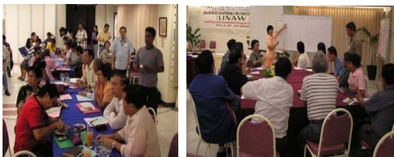
Multi-Sectoral Community Consultative Meetings on Wastewater Management Issues