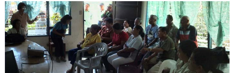
Meeting with Village Officials on the Proposed Septage Treatment Plant.

Alang sa dugang kasayuran tawag sa DCWD 422-6961 ug ENRO 225-9981