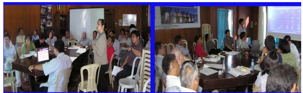
Evaluating Technical and Financial Options