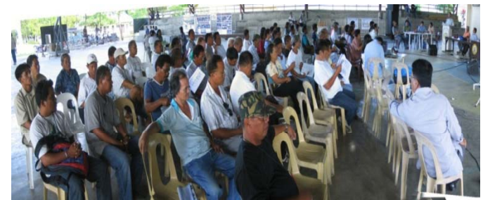
Public Hearing on the Proposed Septage Management Ordinance, December 2005.