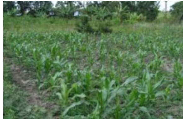
Crops with urine application