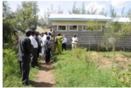
Girls' and boys' UDDTs at Crater View Secondary School, Nakuru