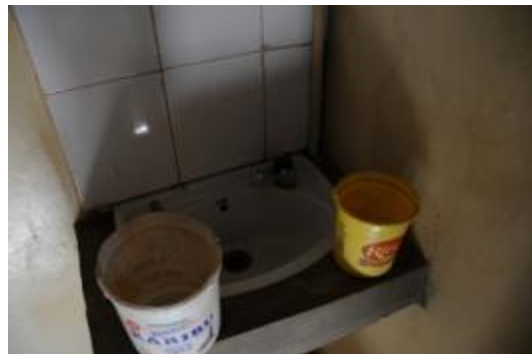
Washbasin with broken/missing lever (Ugunja market)