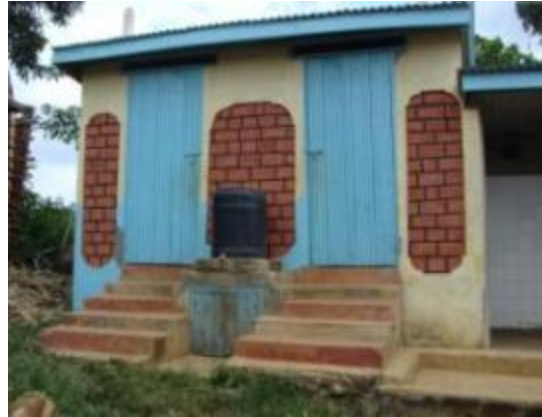
Double door UDDT at Mumias