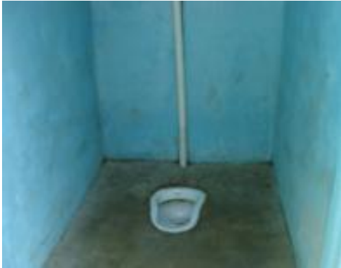
Low flush Toilet pans