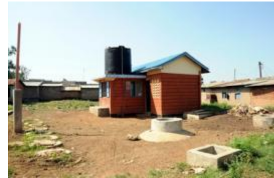
Public toilet linked to DEWATS at Ugunja market