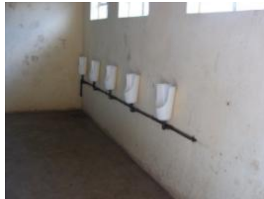
Urinal for boys