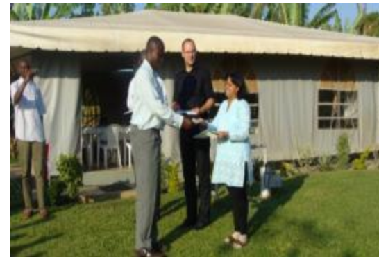
Felicitation of Participants