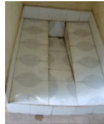
Urinal for girls