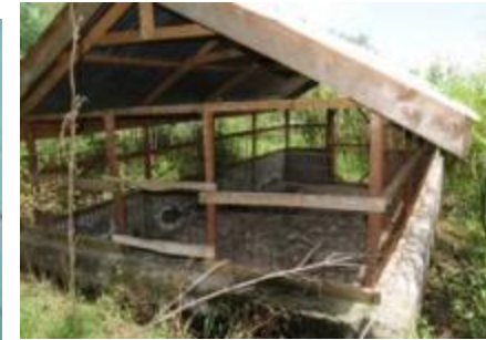
Drying shed for processing faecal matter from UDDTs