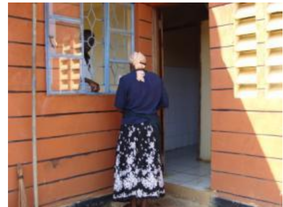
Collection counter at toilet block