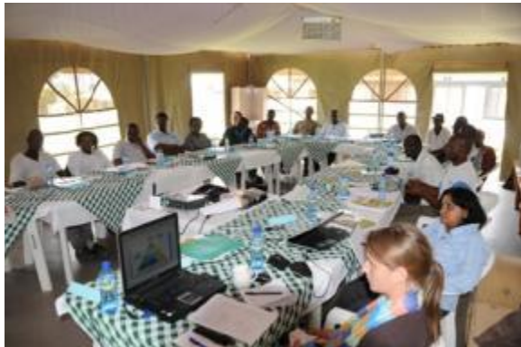
Participants and resource persons