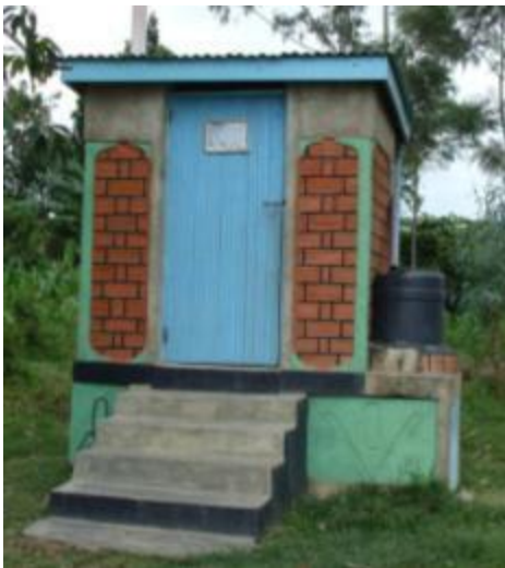
UDDT with Roof top rainwater harvesting