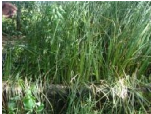
Wetland for Grey water treatment