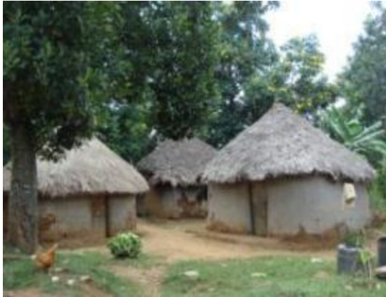
Houses of Beneficiaries