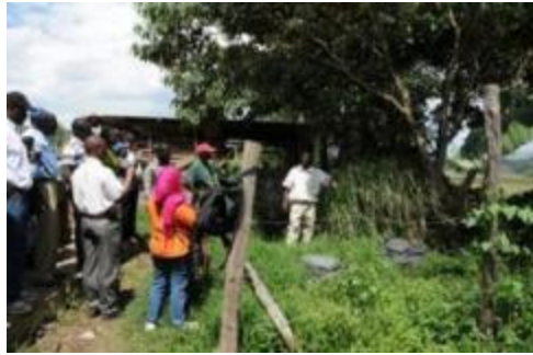
Small-scale constructed wetland planted for treatment of greywater