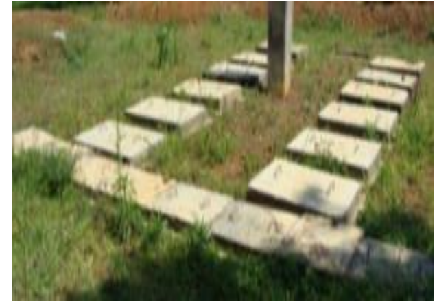
Decentralised Treatment systems