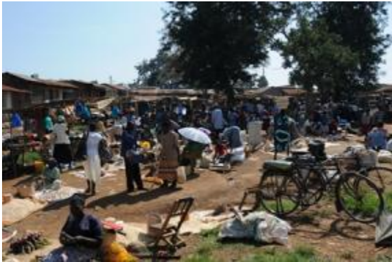
On Tuesdays weekly market takes place in Ugunja

Project is operated and maintained by Ugunja municipal body on trial run to see the cost effectiveness of the project with reference to O and M of the project.