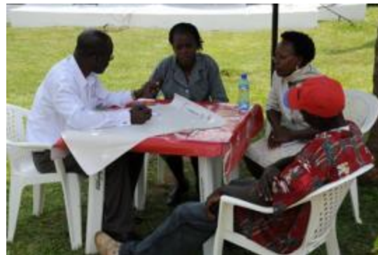
Participants interacting in a group work