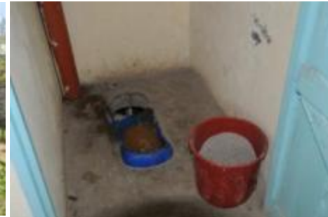
Stagnant urine in urine-diversion squatting pan due to blockage of urine pipe