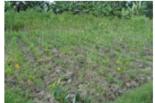
Crops without urine application