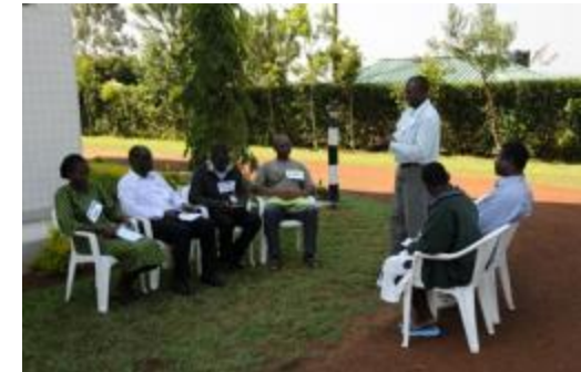
Participants performing a role play on promotion of ecosan