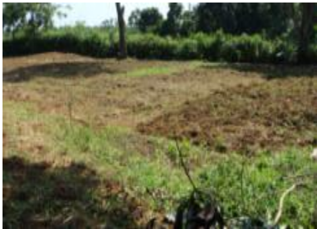
Reuse Gardens at School Premises